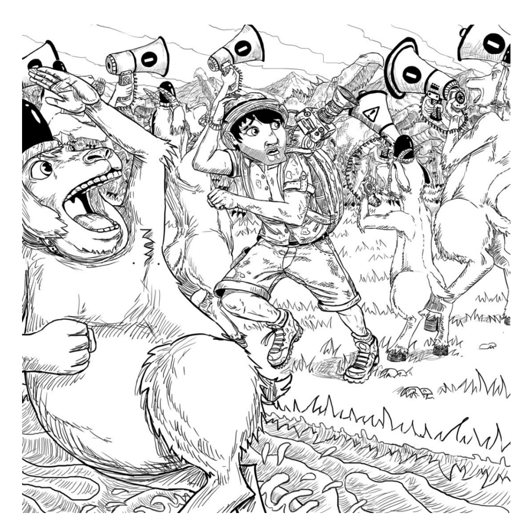
The entire Terror Bird nation was now chasing them.

They ran back over the stream and up the hill. But what they heard sounded like thunder.