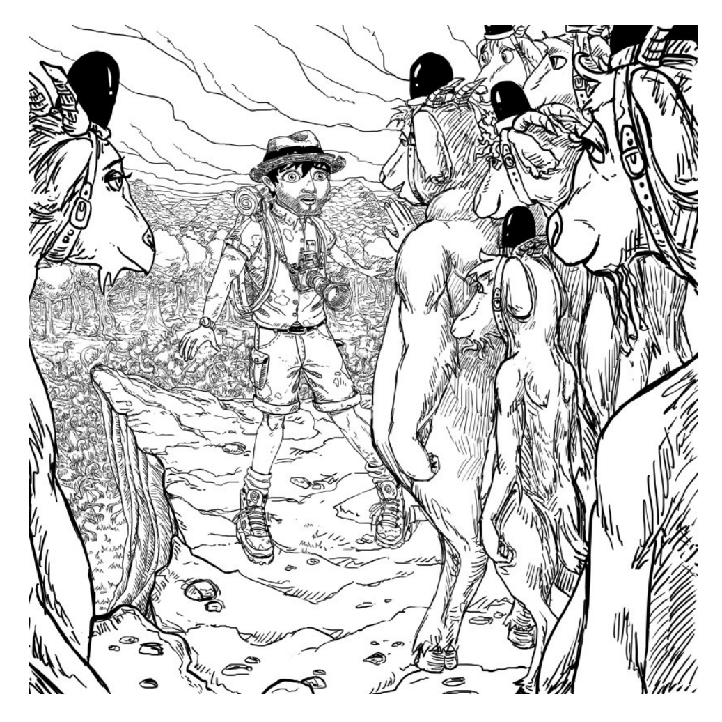
Mountain goats. At least a dozen of them. Some with flashing lights and sirens strapped onto their silly heads. The one talking to him was all brown and a bit larger than the others.