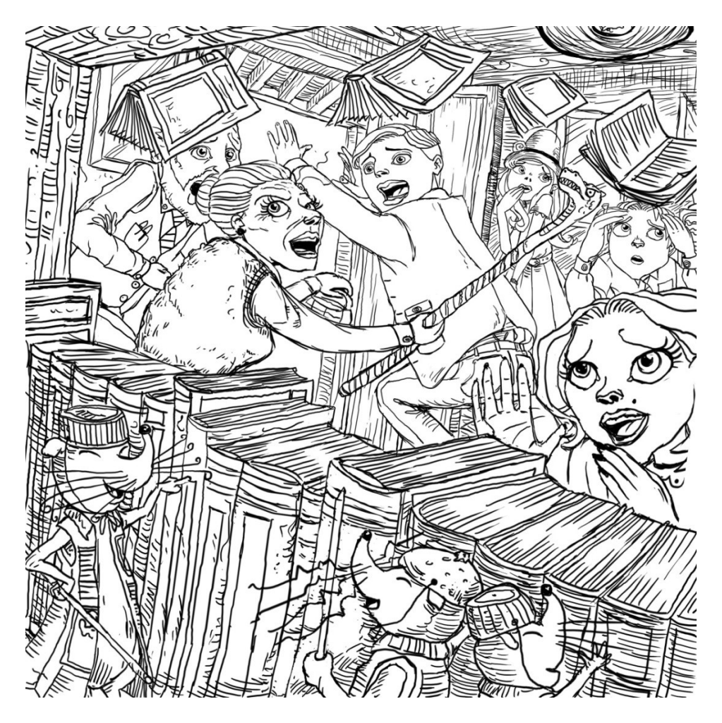
The chandeliers swayed, books flew off the shelves, and then the radios and televisions all turned on at once.

All the agents screamed and ran for the door, the older woman beating them with her cane so that she made it out first.