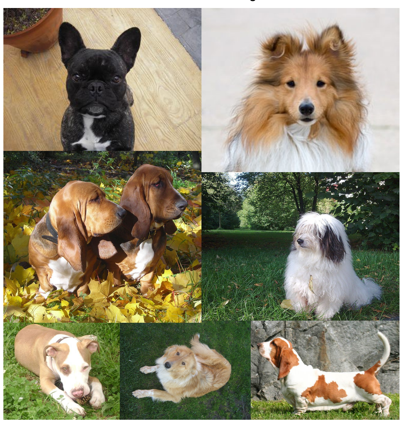
"Do you know how to look after a dog?" She asked me.

But Mum said, first I needed to learn more about dogs.