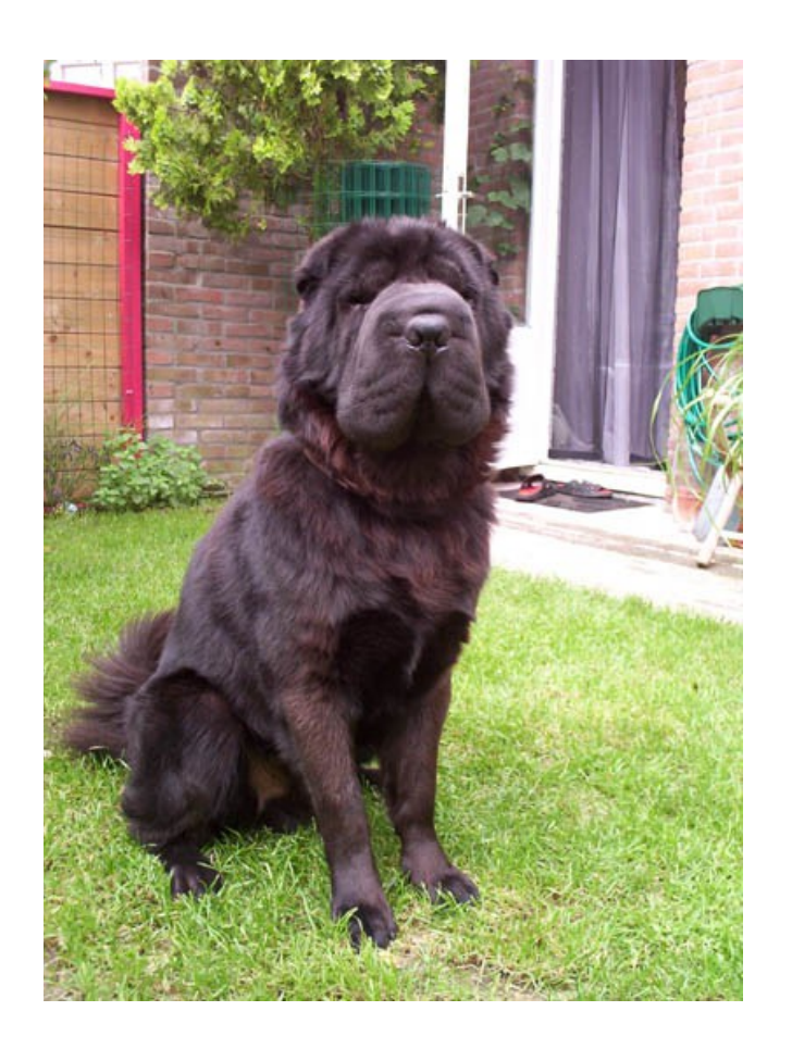
What about a Broholmer?

The Shar Pei was originally bred as a place guard dog in China, but, we don't have a palace.