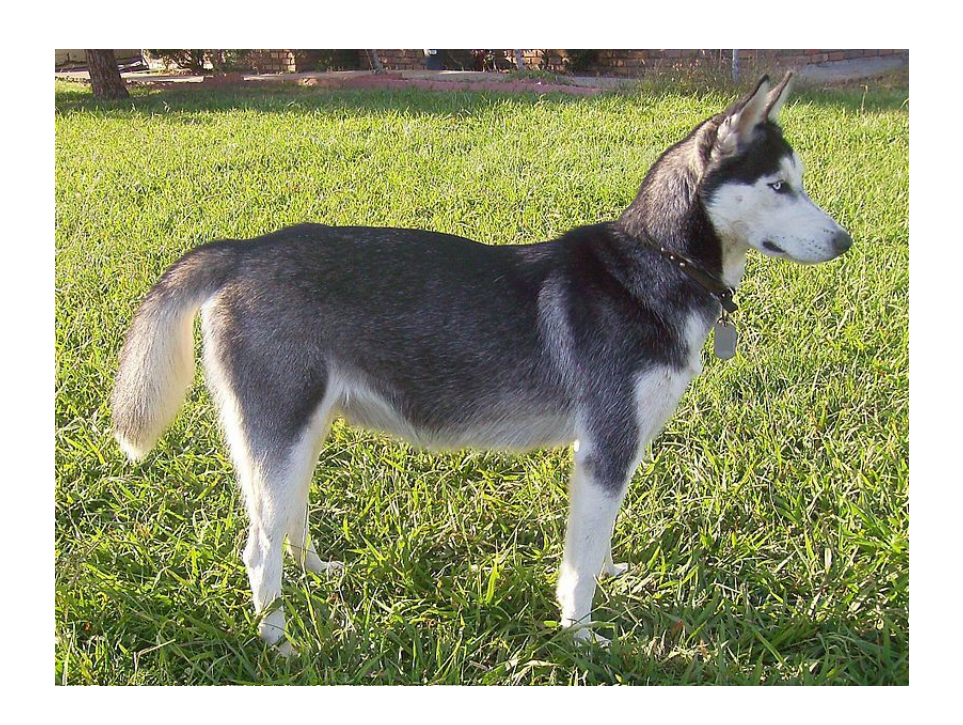
I guess we'd have the same problem with a Canadian Eskimo Dog.

An Alaskian Husky is a very nice dog, but it would be really hot for him in summer, since we don't live in Alaska.