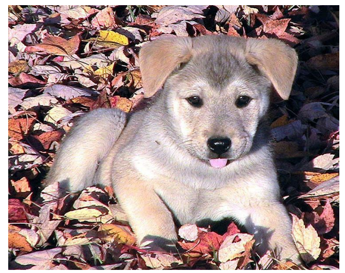
Older dogs are trained, but may have learned bad habits.