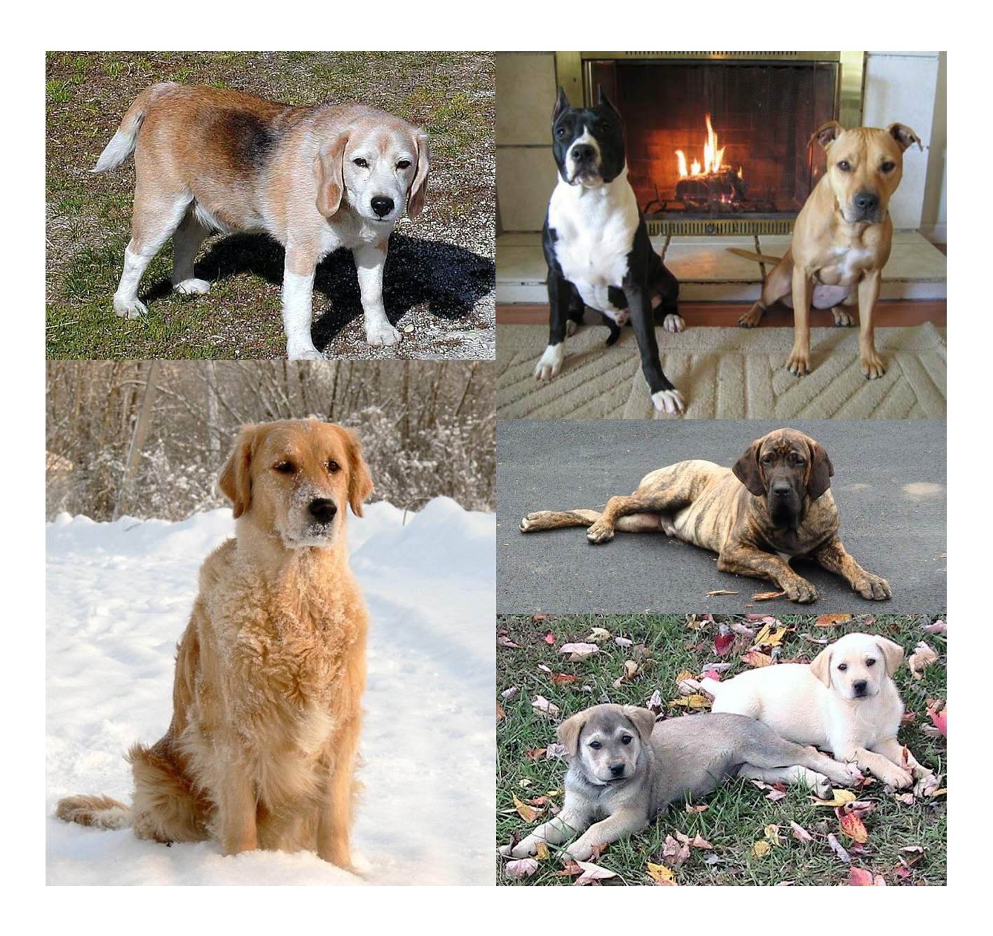
I hope you enjoyed learning about dogs as much as I did.