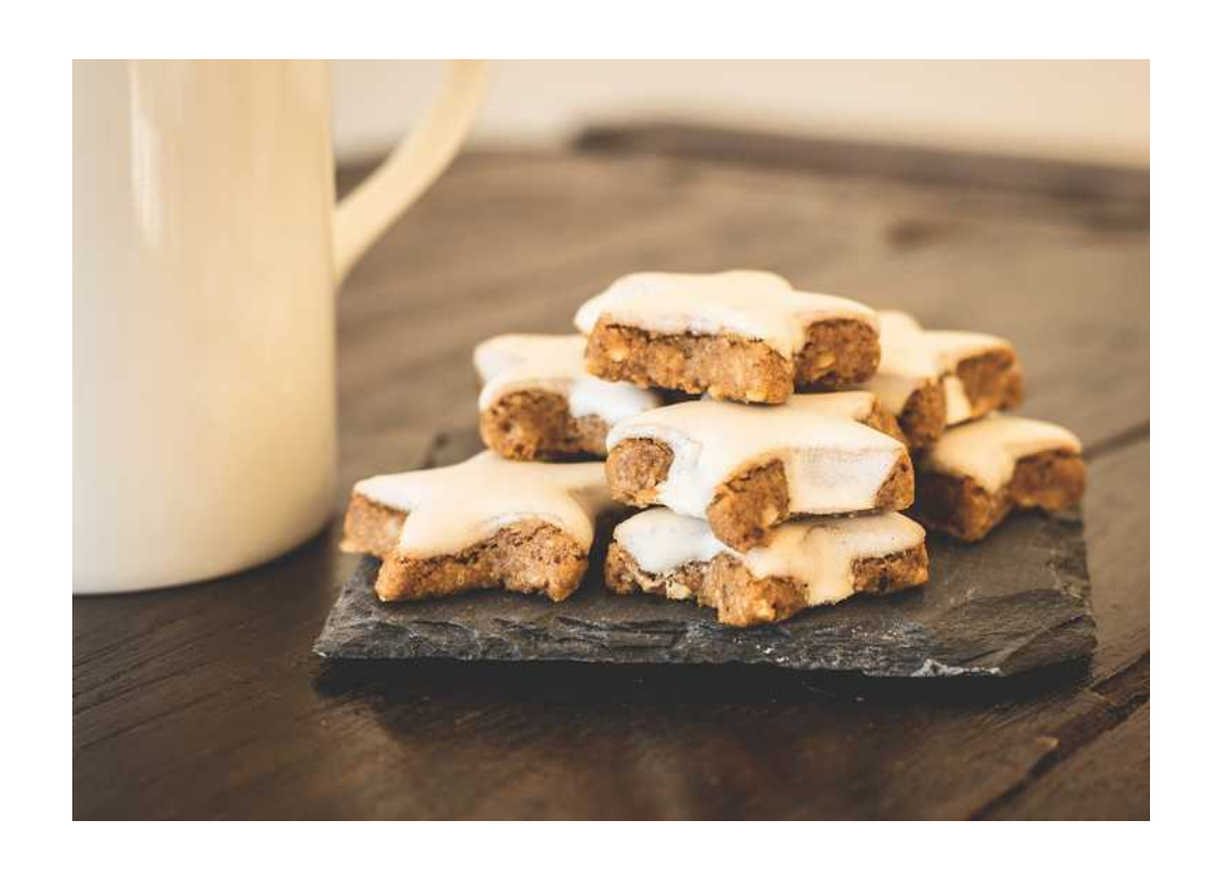
Christmas Cookie Recipe 3/4 cup soft butter or margarine, 2/3rds of a cup sugar, 1 cup plain flour, 1 egg yolk

Optional, add a small quantity of some of your favourite flavours: a pinch of salt, 2tsp vanilla extract, the juice and zest of 1 lemon or orange, chopped dry fruit, chocolate chips, Sprinkles, eg. hundreds and thousands, chopped nuts, mini marshmallows, work on different combinations!