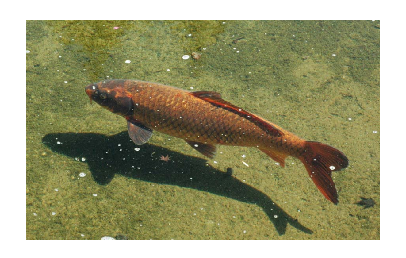
The fish is in the water.