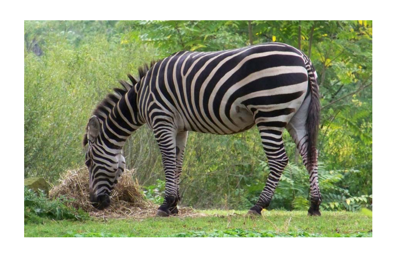
The zebra is on the grass.