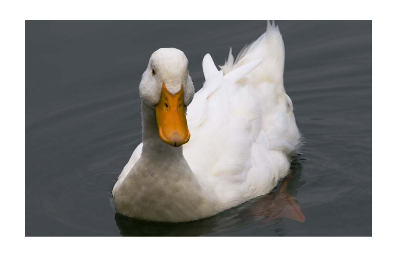
The duck is in the water.