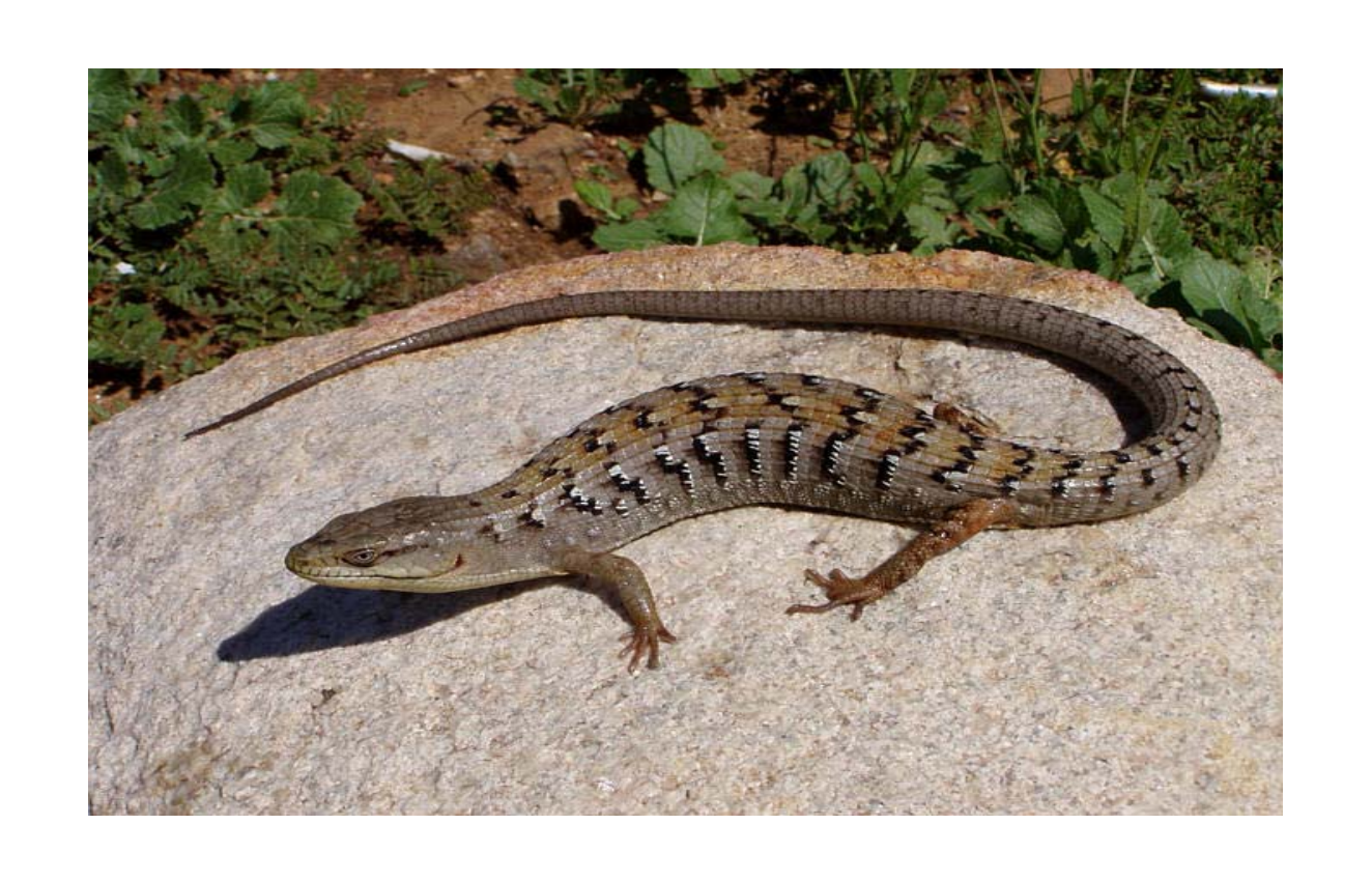
The lizard is on the rock.