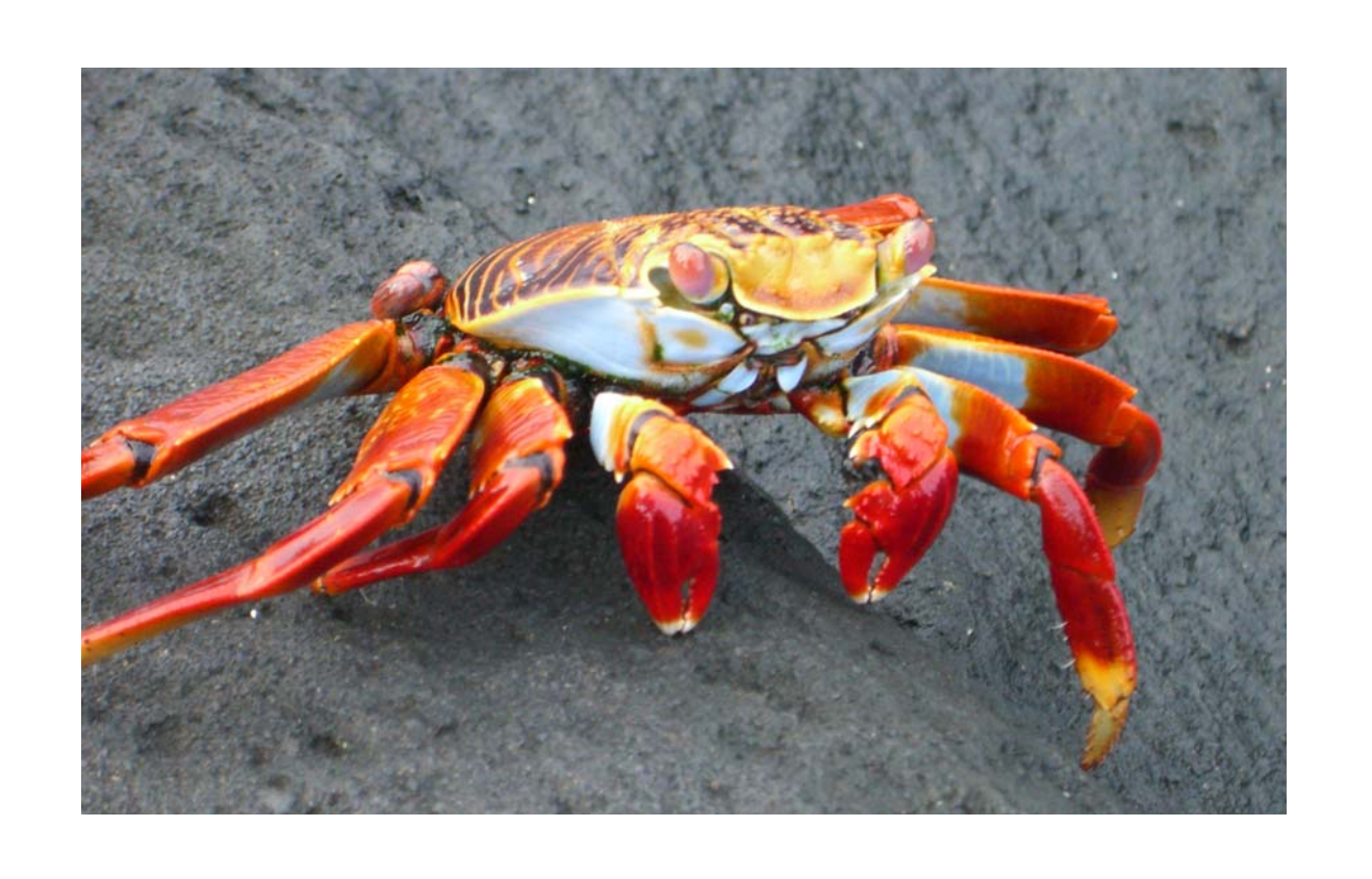
The crab is on the rock.