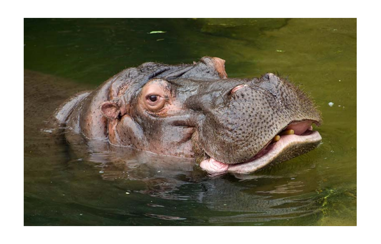
The hippo is in the water.