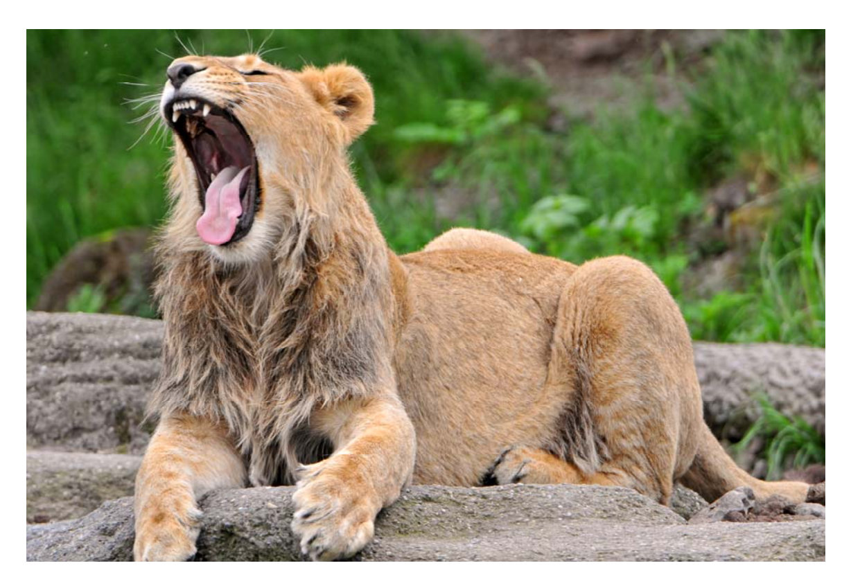
The lion is on the rock.