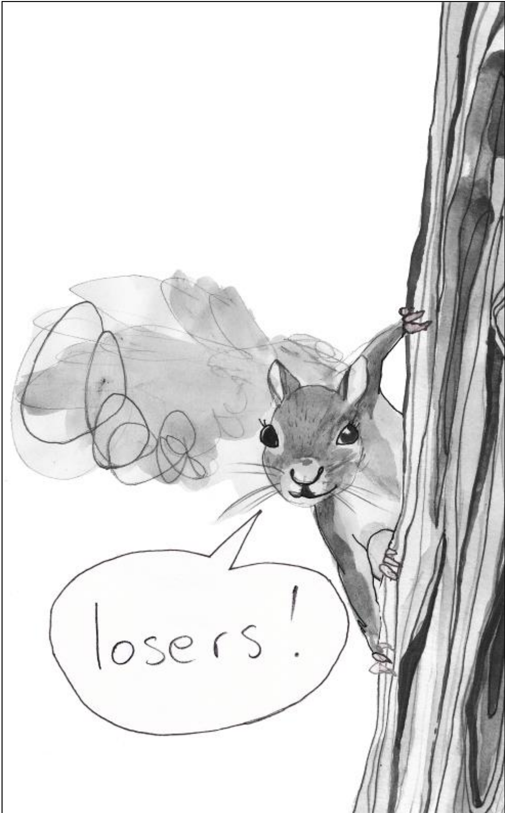
Harsh language, but fully justified under the circumstances.