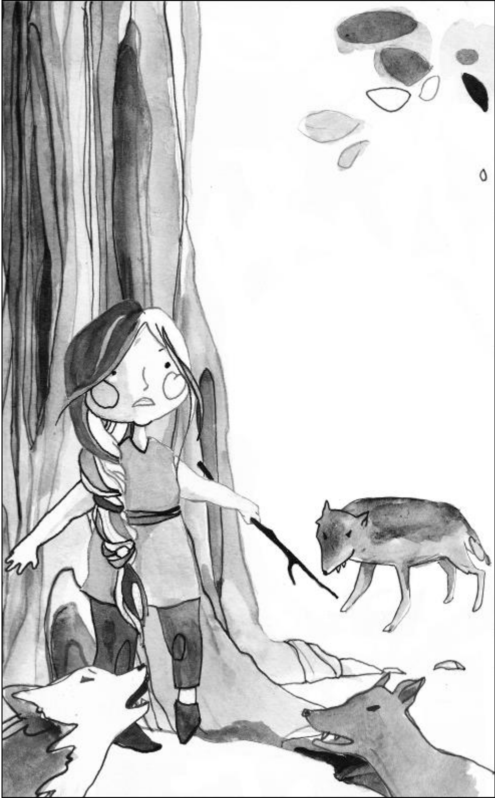
The wolves snapped closer and closer.