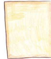
A blank paper