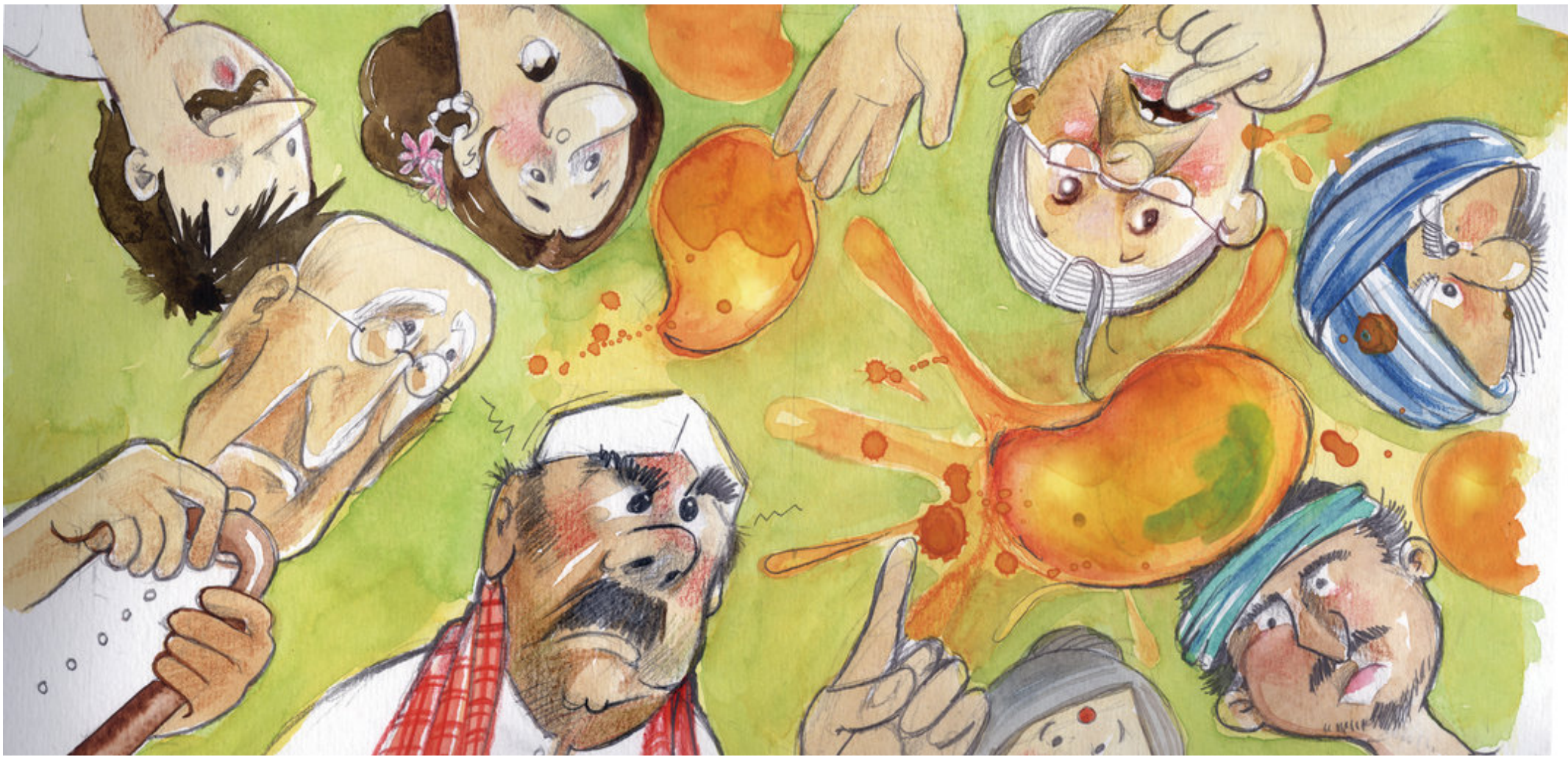
Flying spectacles, mango umbrella Grandma's juggling annoyed everyone