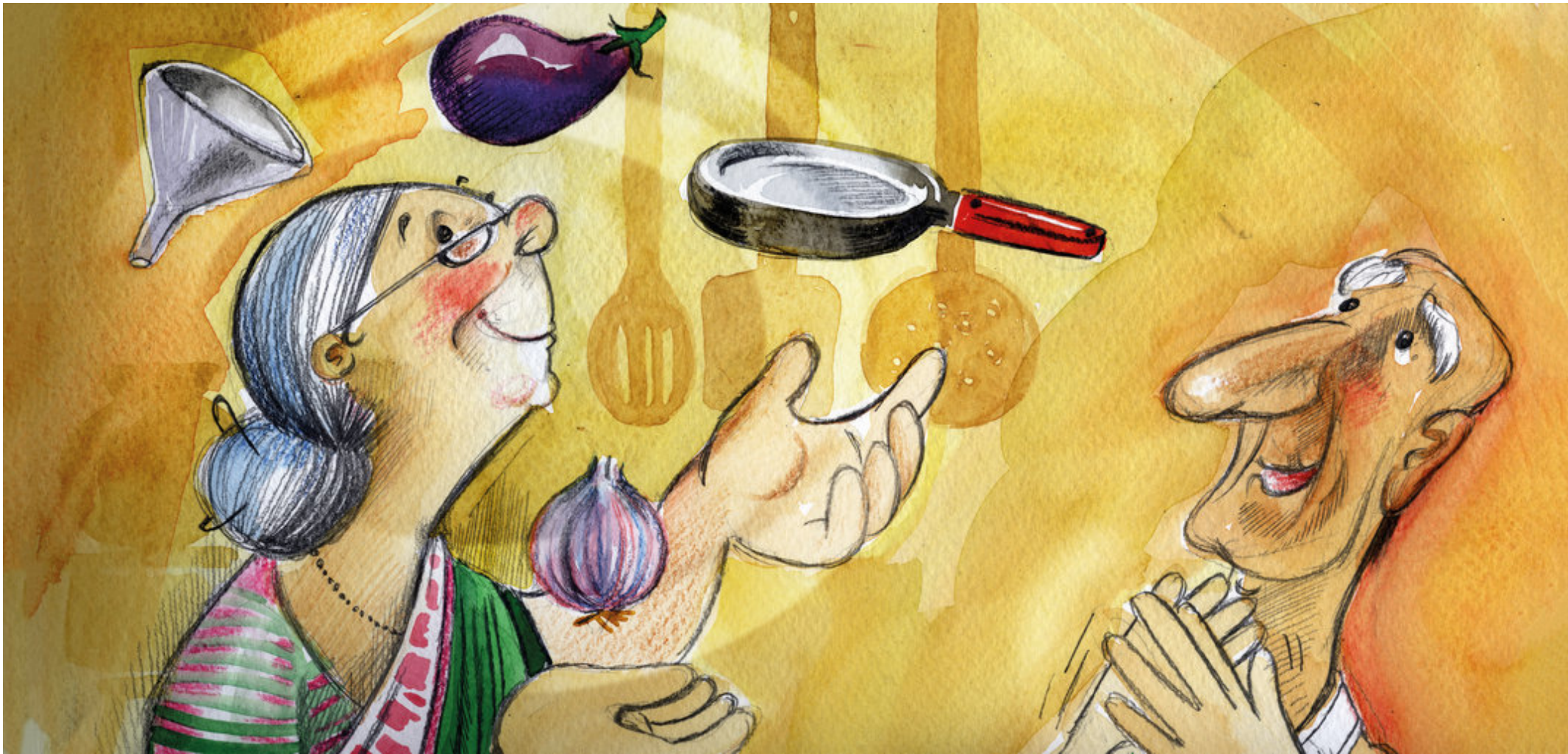
Our Grandma was a juggler