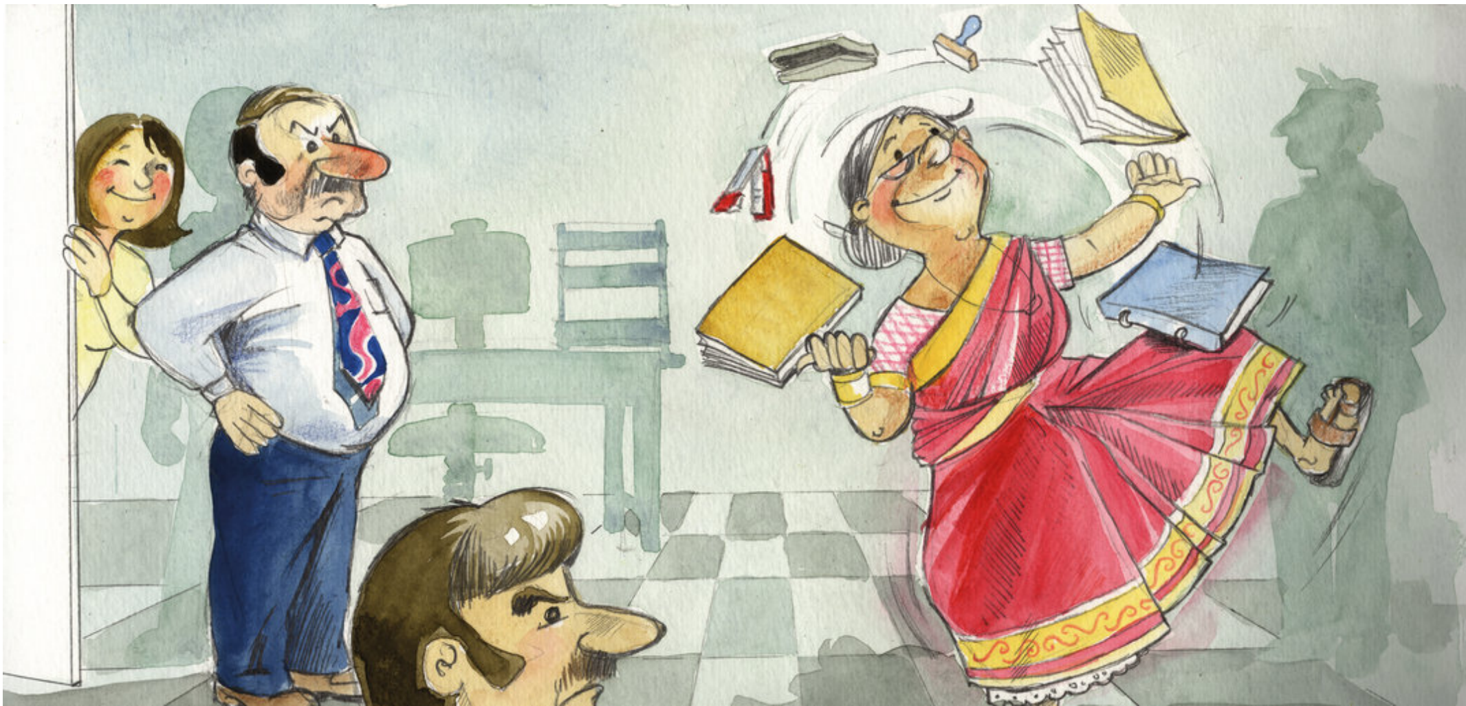
Kitchen, market, office Grandma juggled everywhere