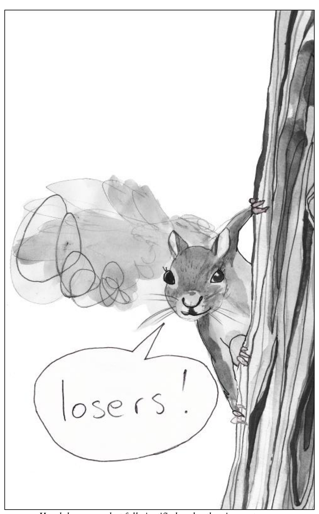
Harsh language, but fully justified under the circumstances.