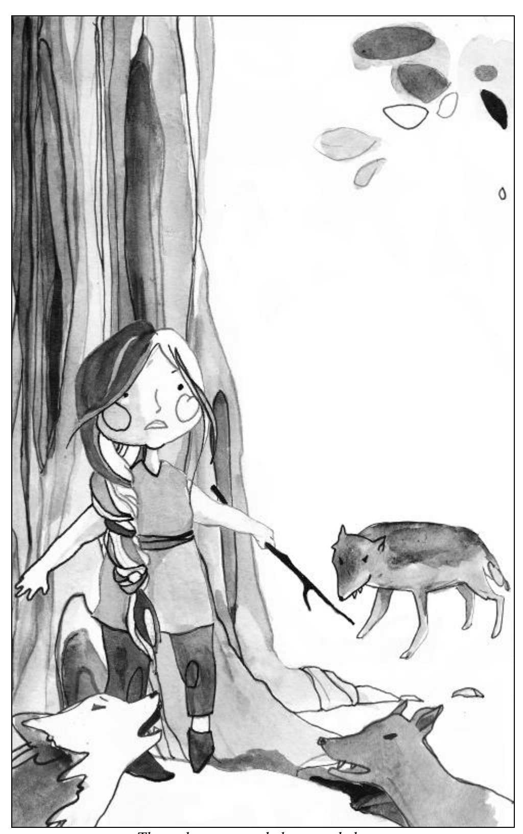
The wolves snapped closer and closer.