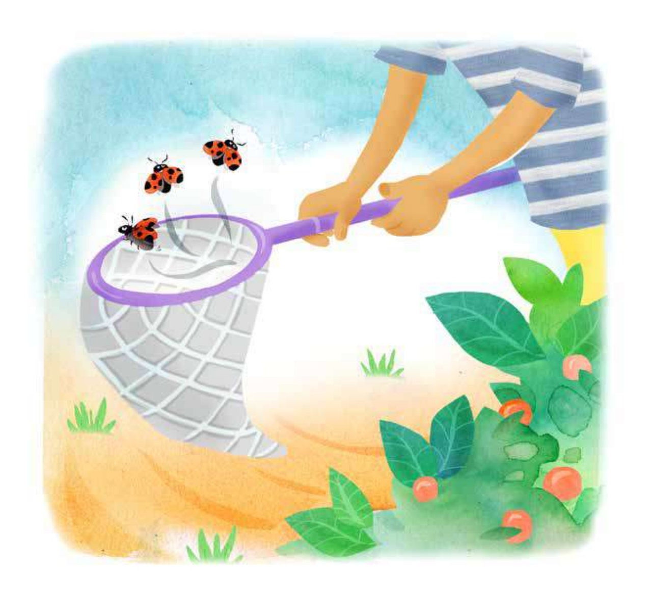
Three at the park.