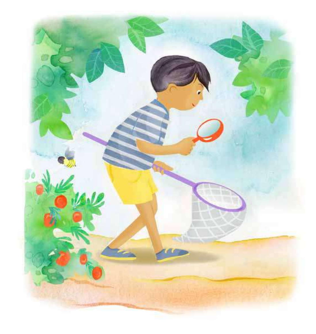
For a whole week, Amir looked and searched and collected.