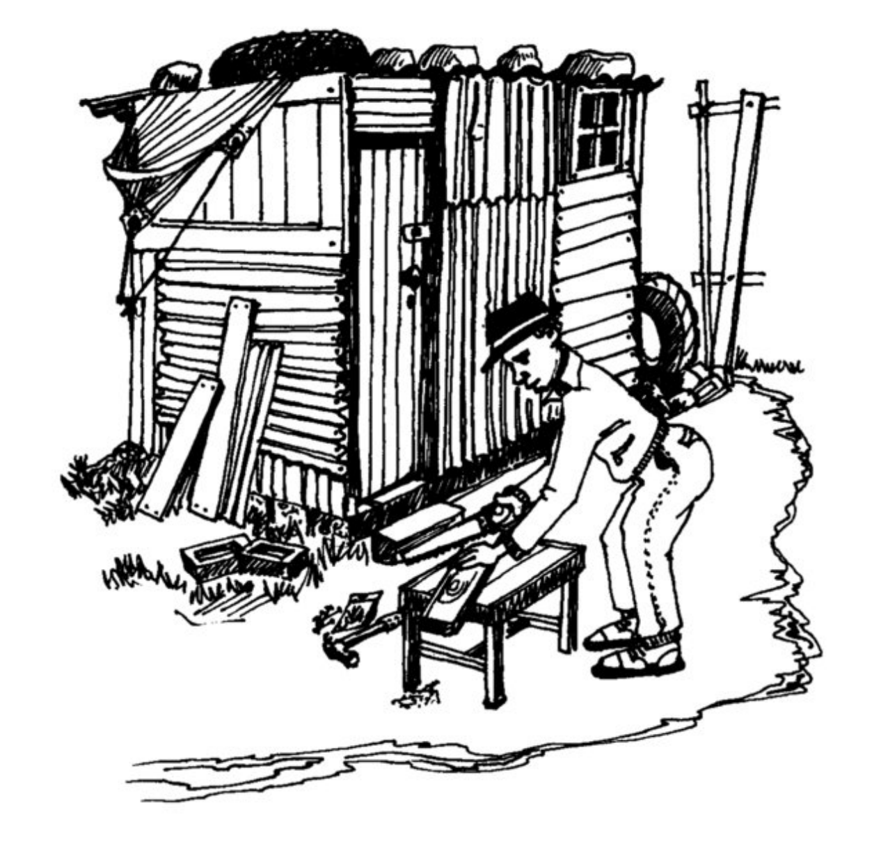
This man is building his own house.