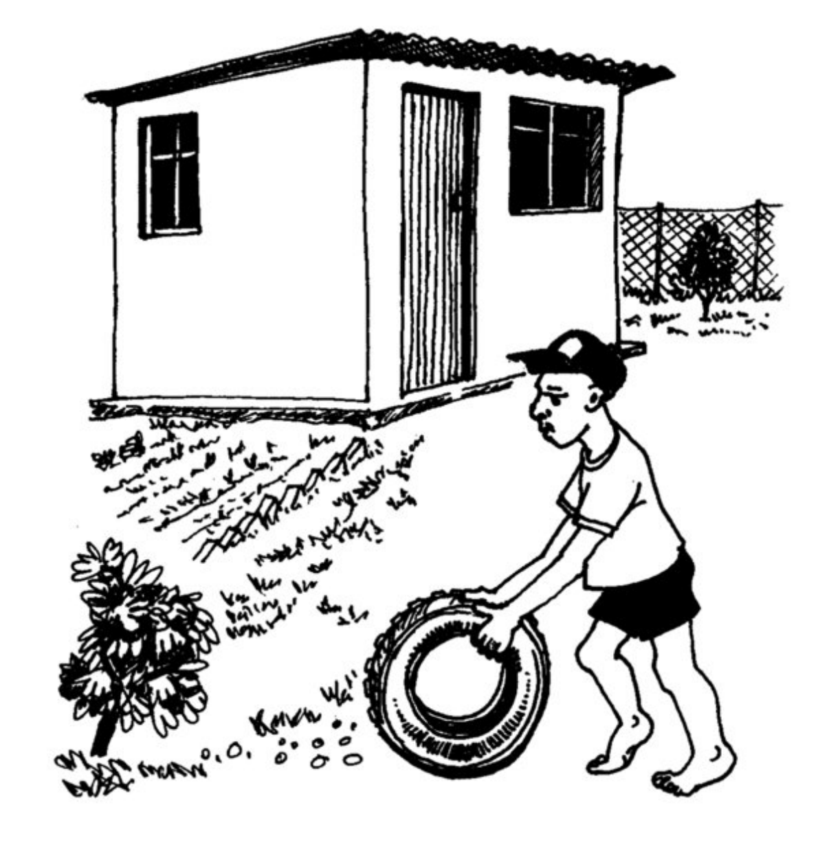
Thulani lives in a square house.