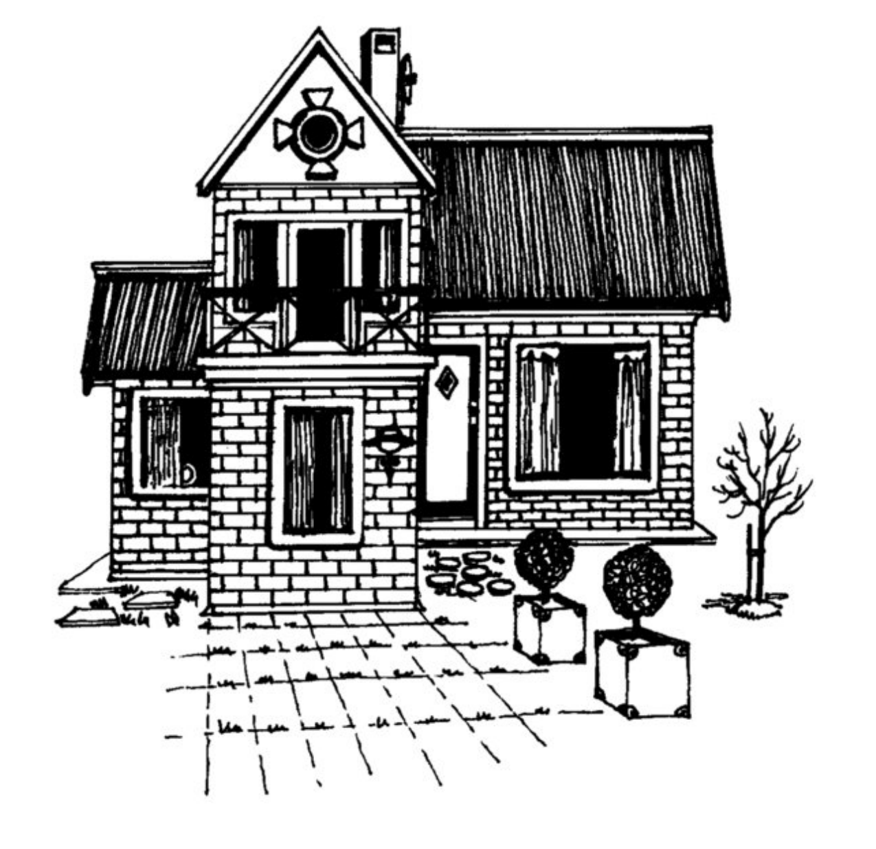
This house is new.