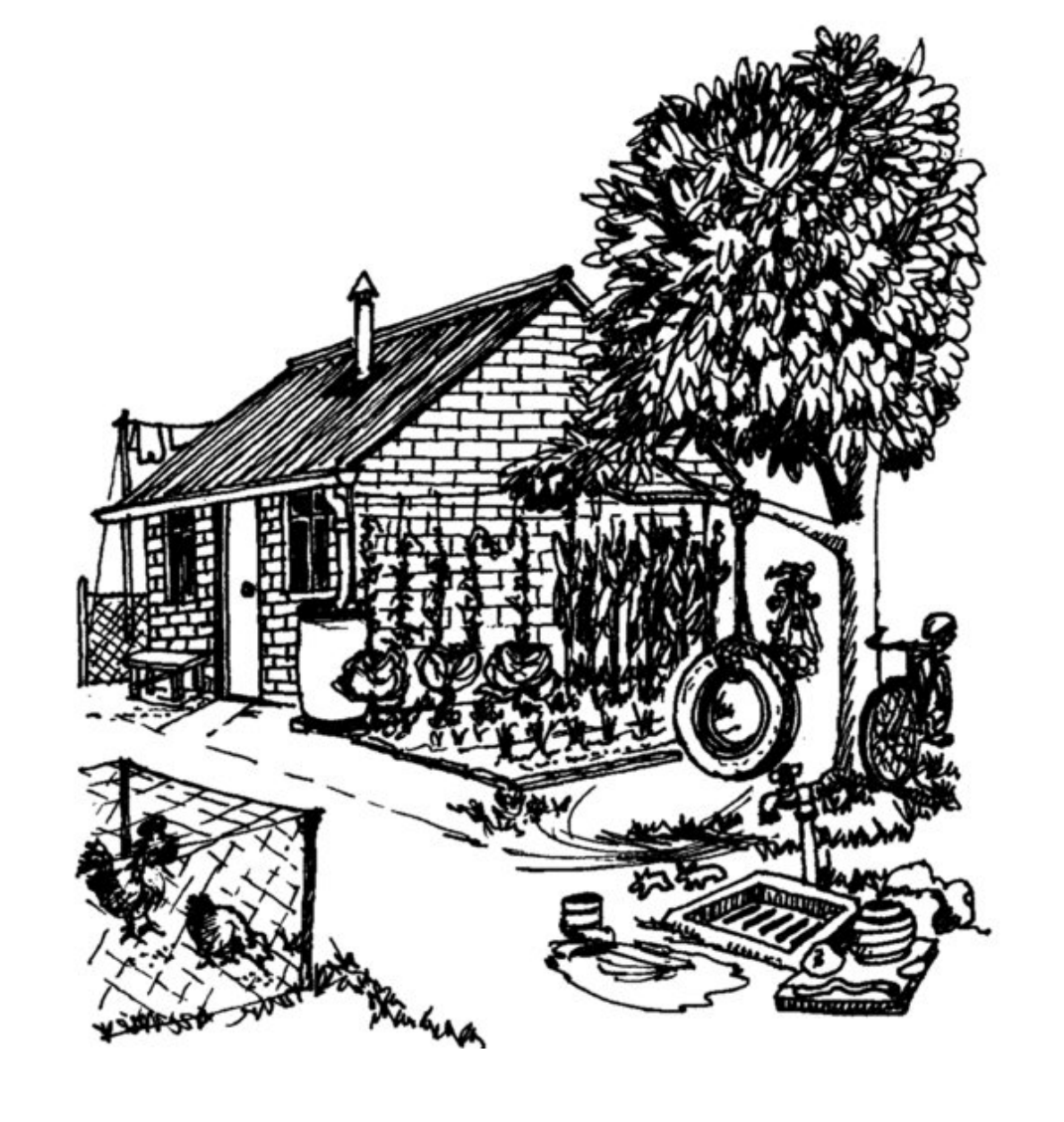
I wish I lived in this house.