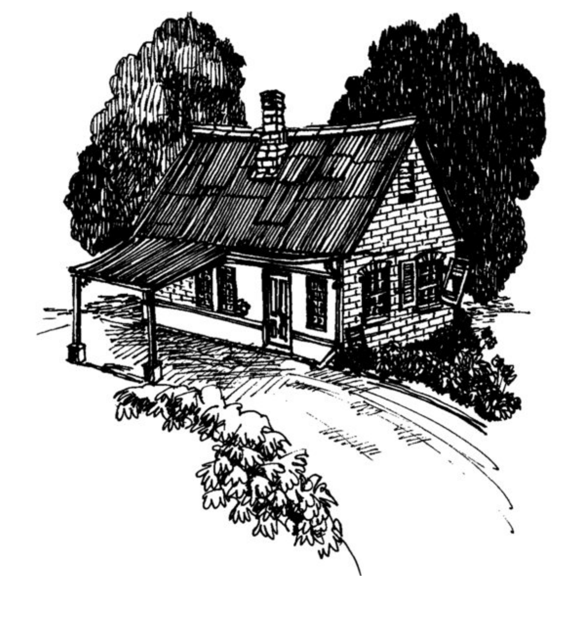
This house is old.