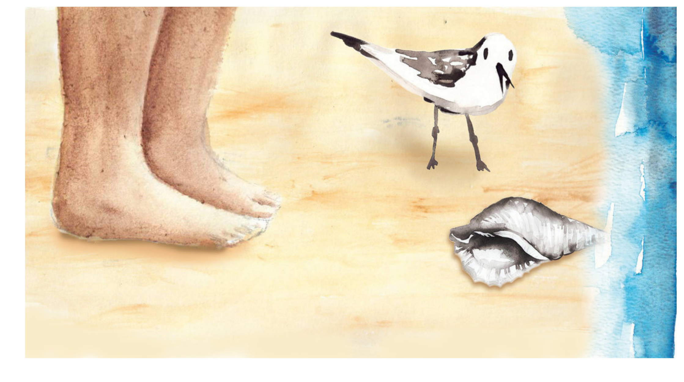
A chasing wave brings me a shell. It leaves it for me on the wet sand.