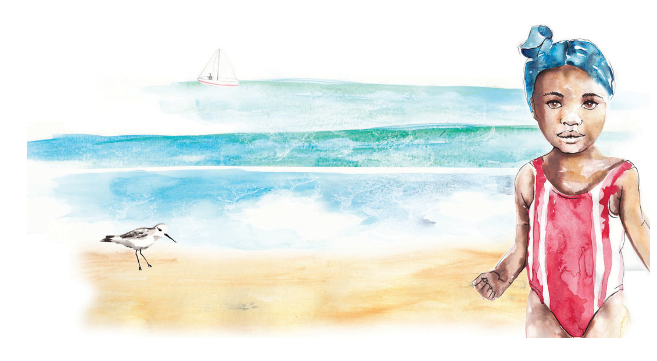
Oh, I love the sea.