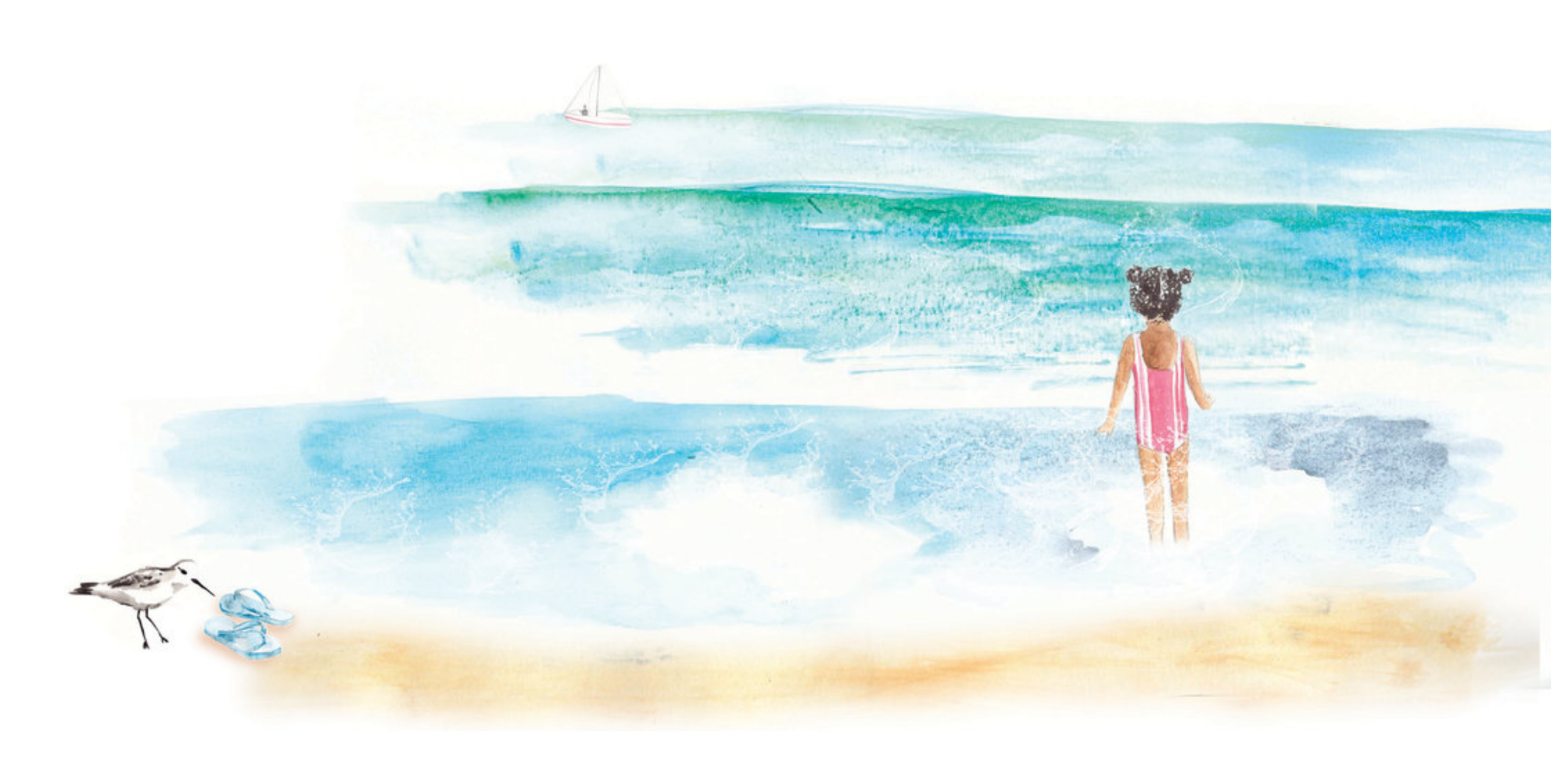
I have sea and sand in my toes.