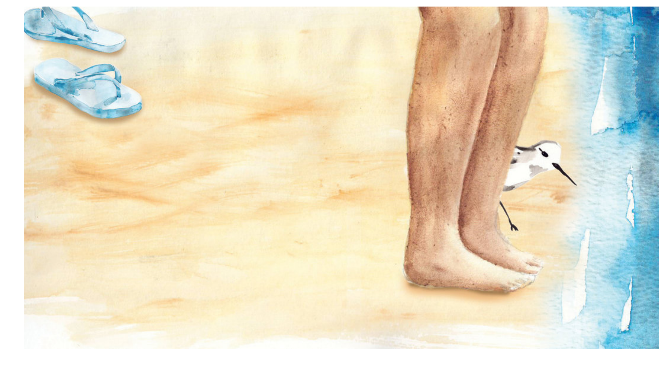
On the edge of the sand is the water. That's where my toes touch the sea.