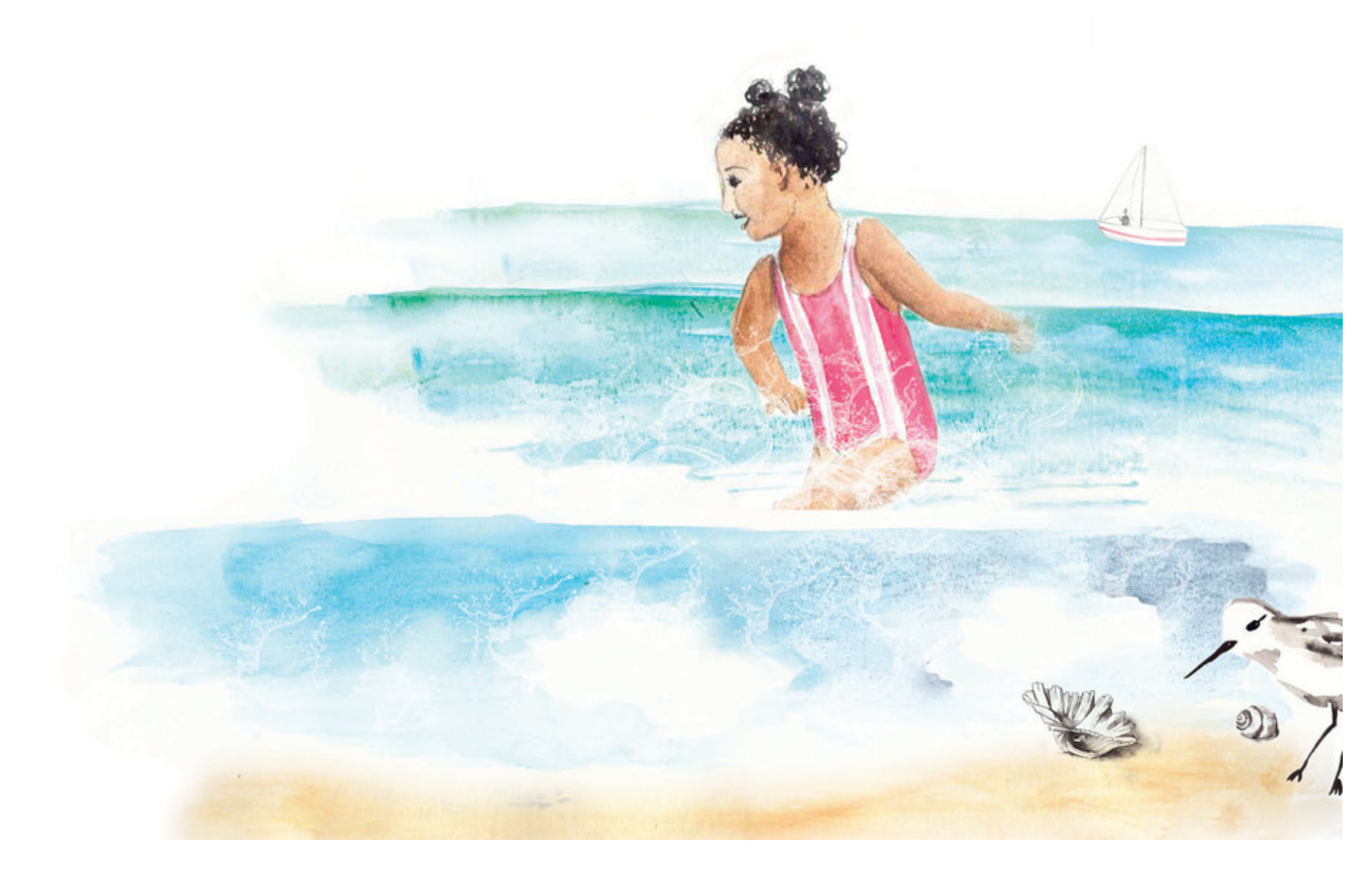
Then the waves say yes, and I say yes too.