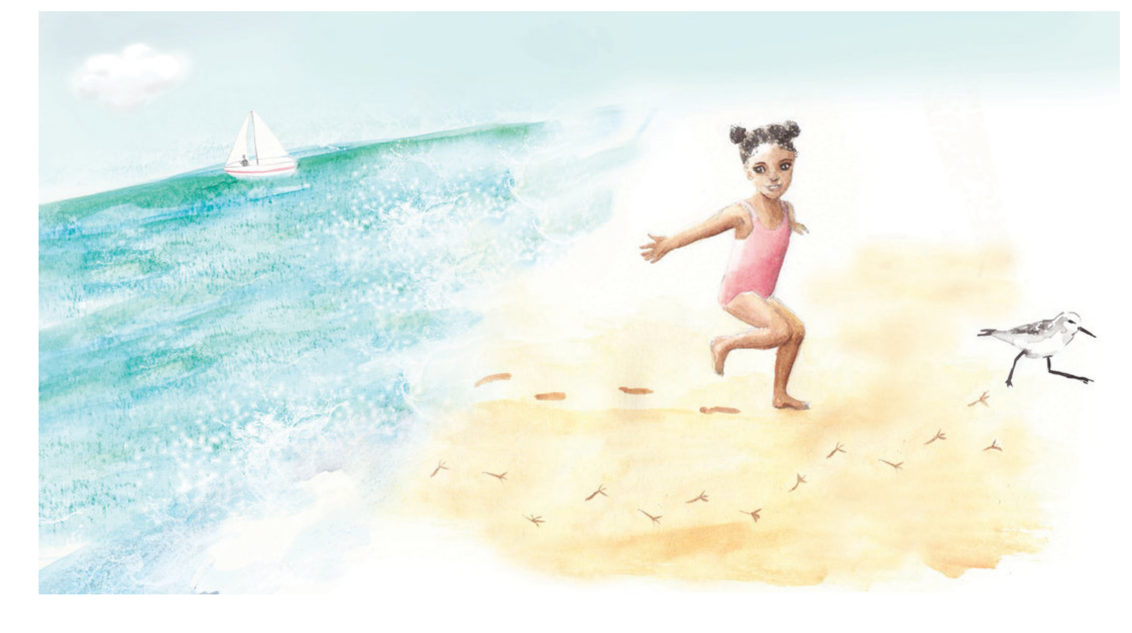
They say yes, I say no. They say no, I say yes. The sea chases me, and I chase the sea.