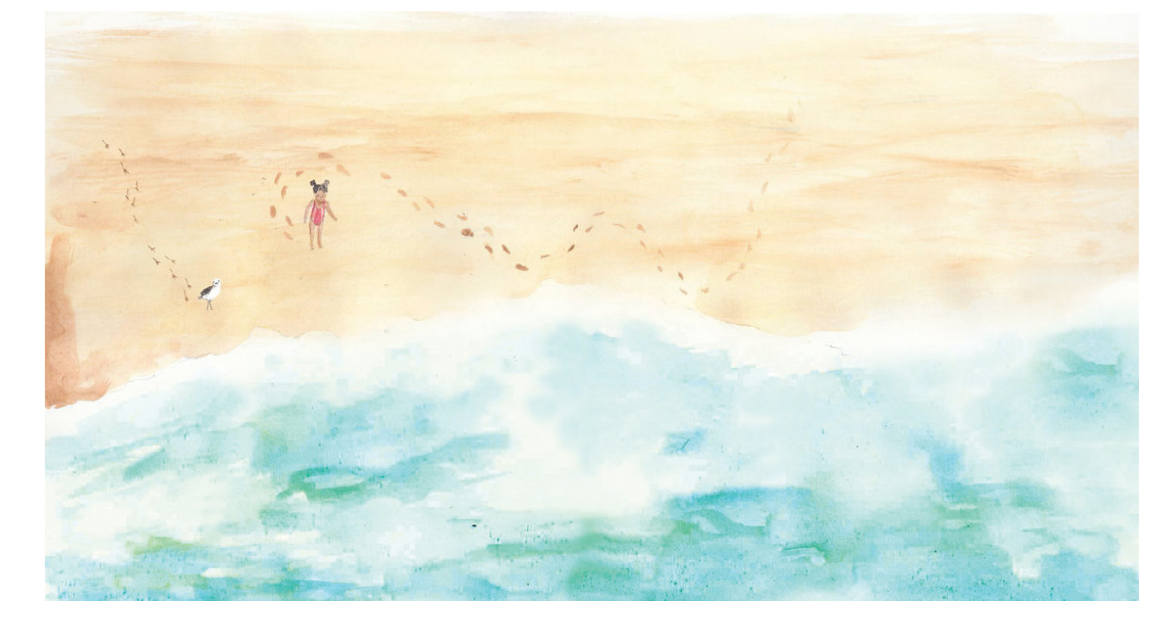
I chase the waves home to the sea.