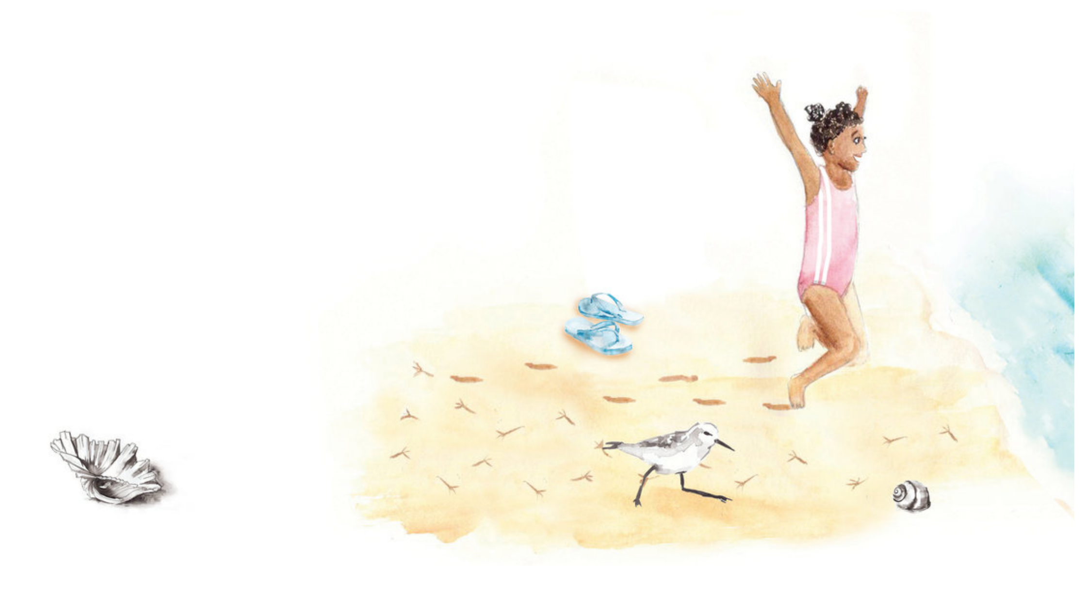
They say no, I say yes. I run back to the edge.