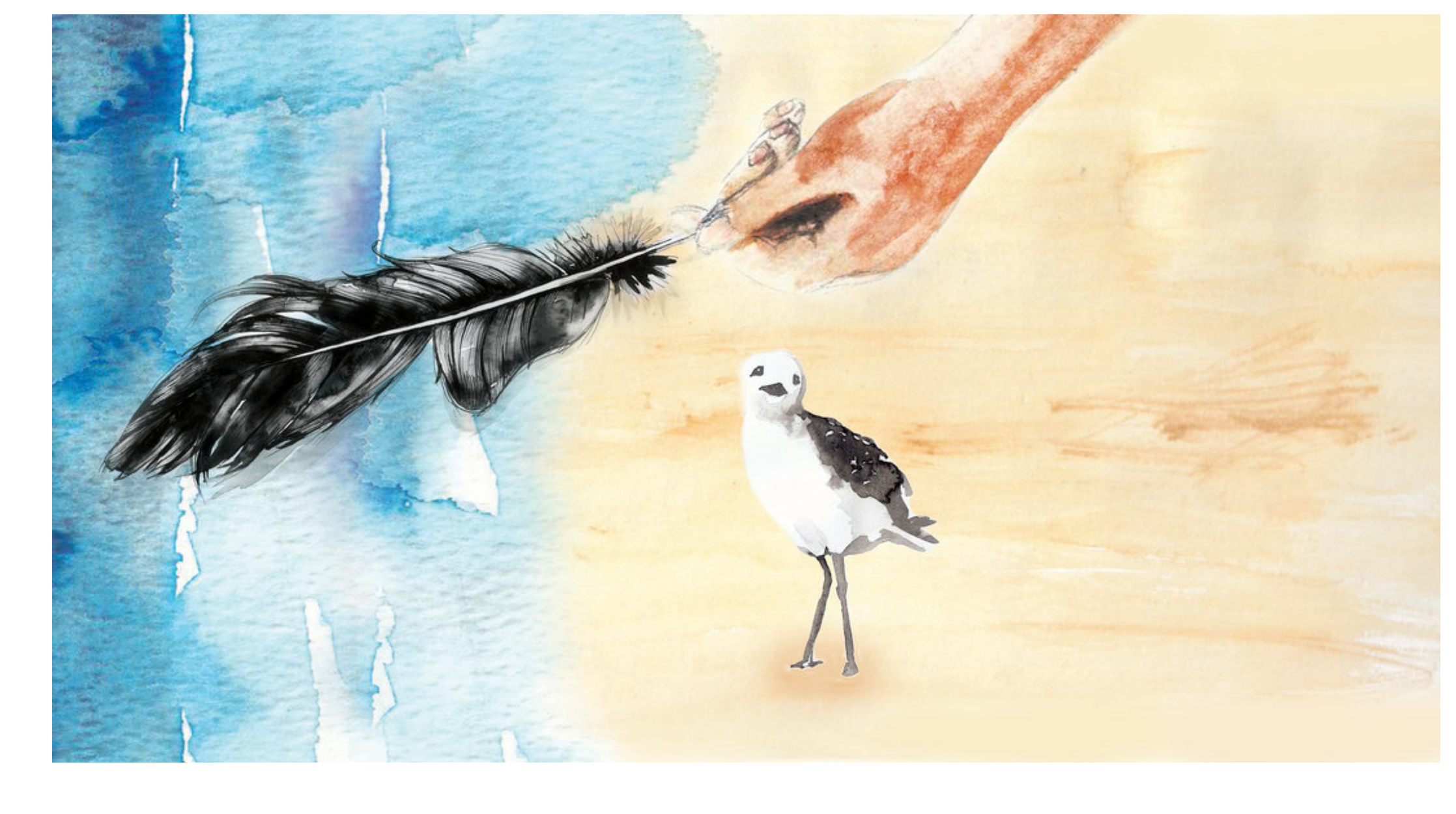
I find a feather in the dry sand, and I send it on a wave to the sea.