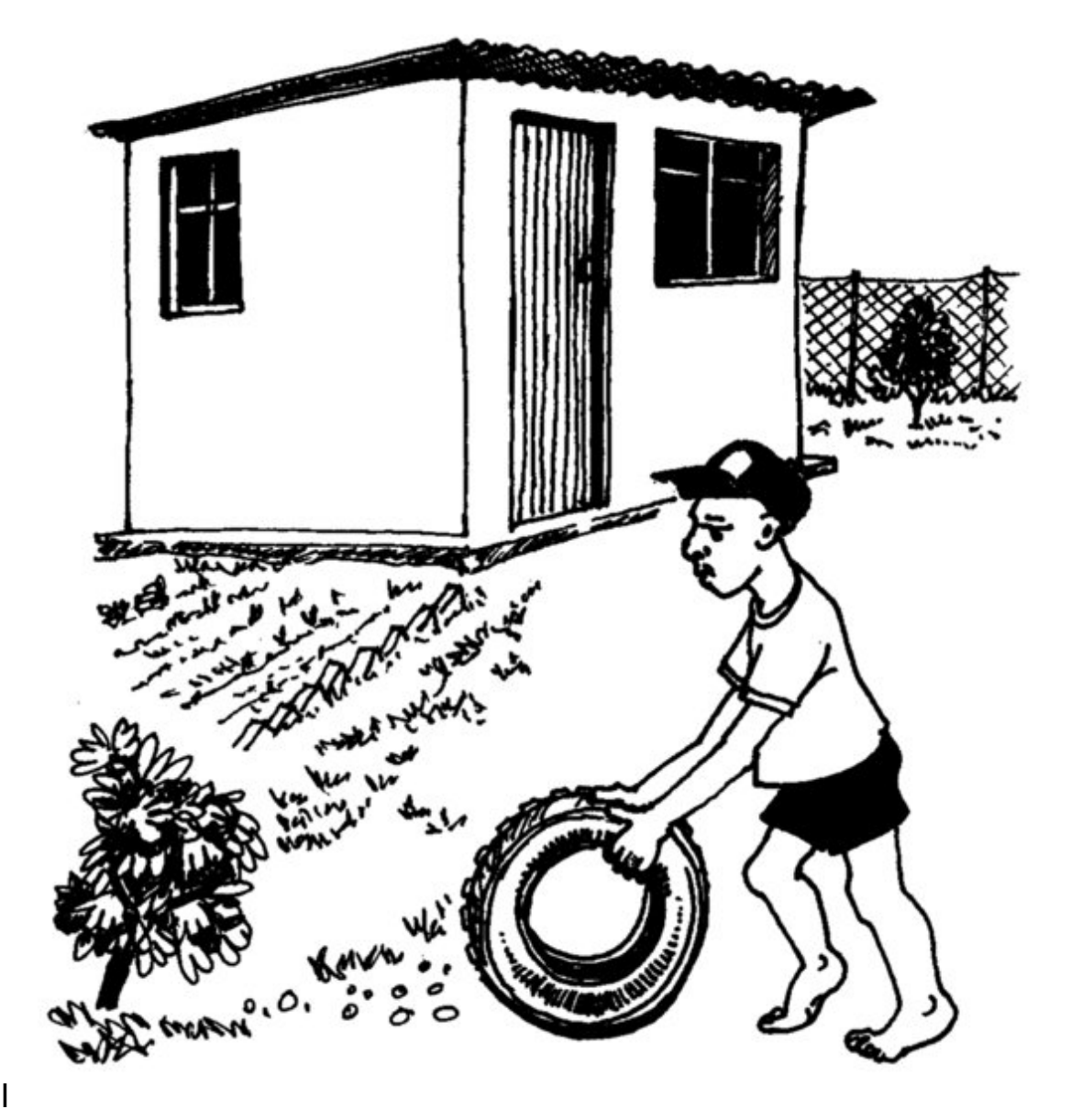
थुलानी एक चौकोर घर में रहता हैं।