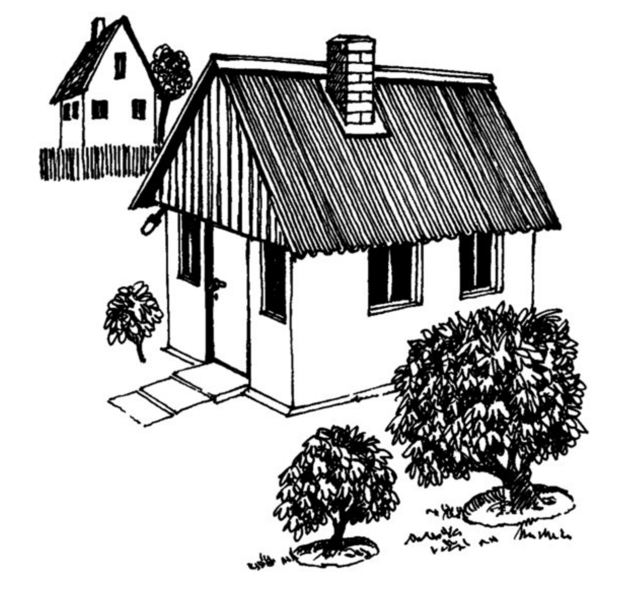
इस घर की छत एक त्रिकोण है।