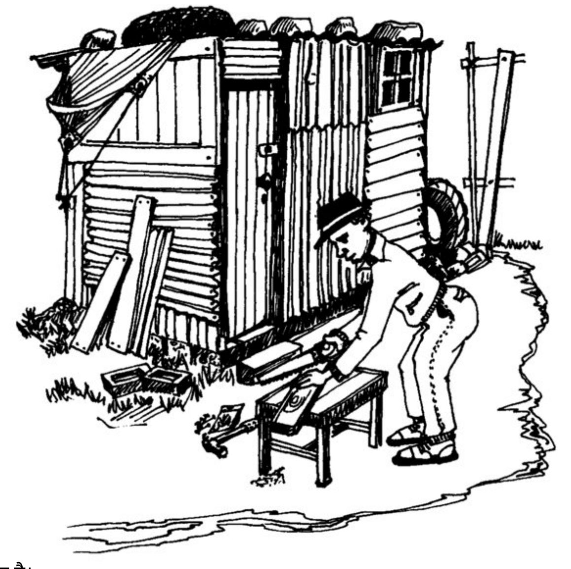
यह आदमी अपना घर खुद बना रहा है।