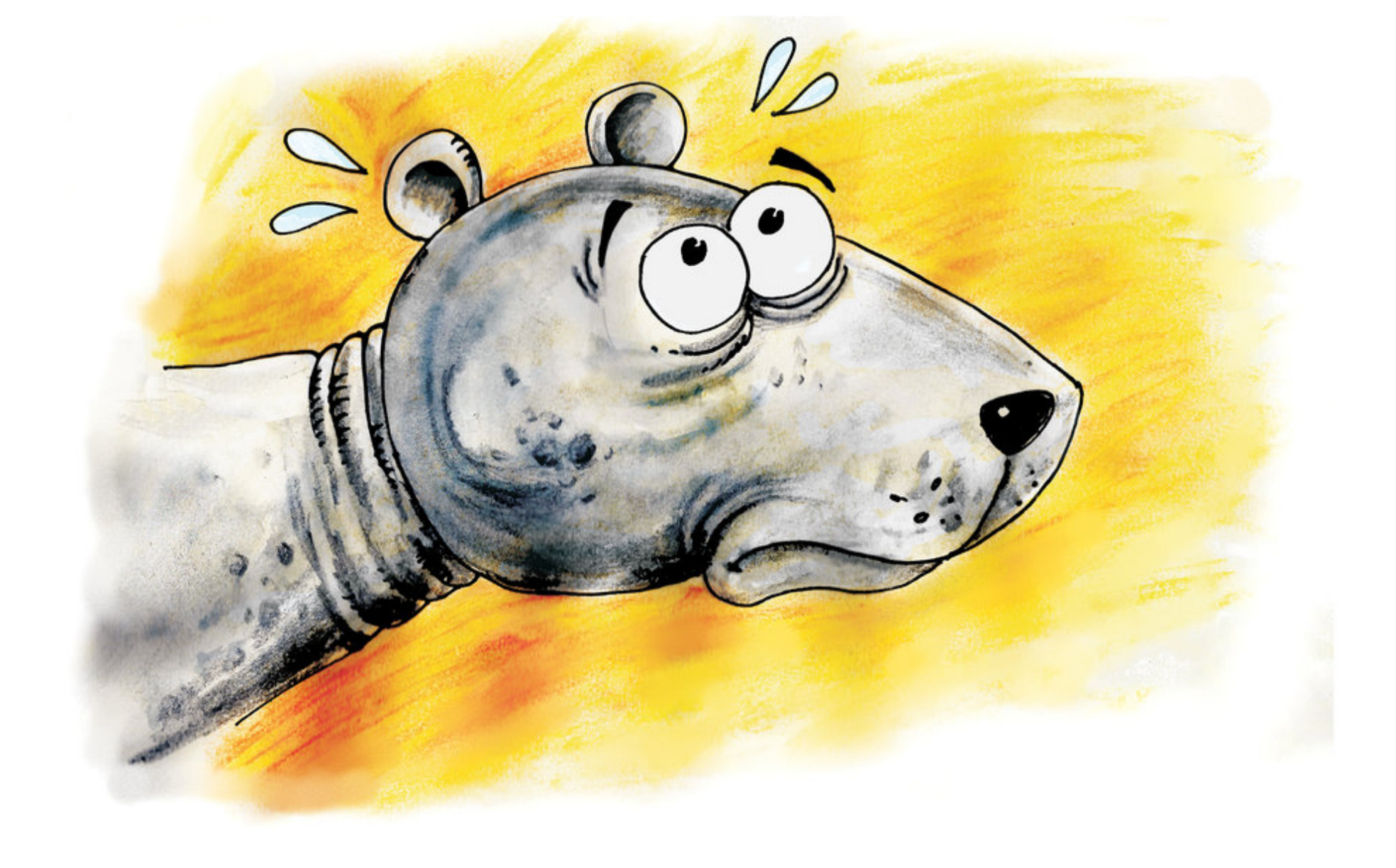
"I think I will get my old skin back. It was softer, smoother and more fun," thinks Tingu. "Ranga Rhiger! Where are you?"