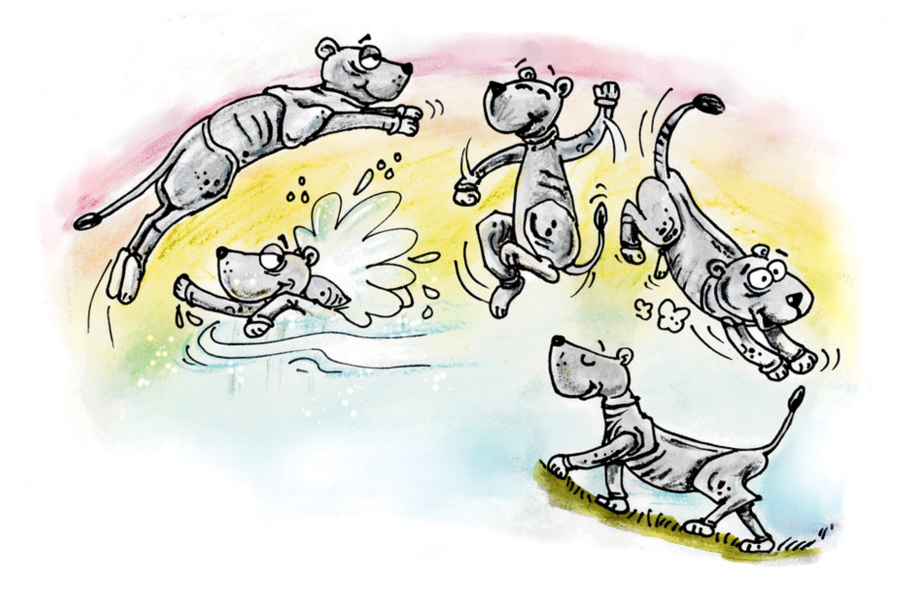
Tingu Tino jumps, dances, swims, runs, and marches happily in his new grey skin.