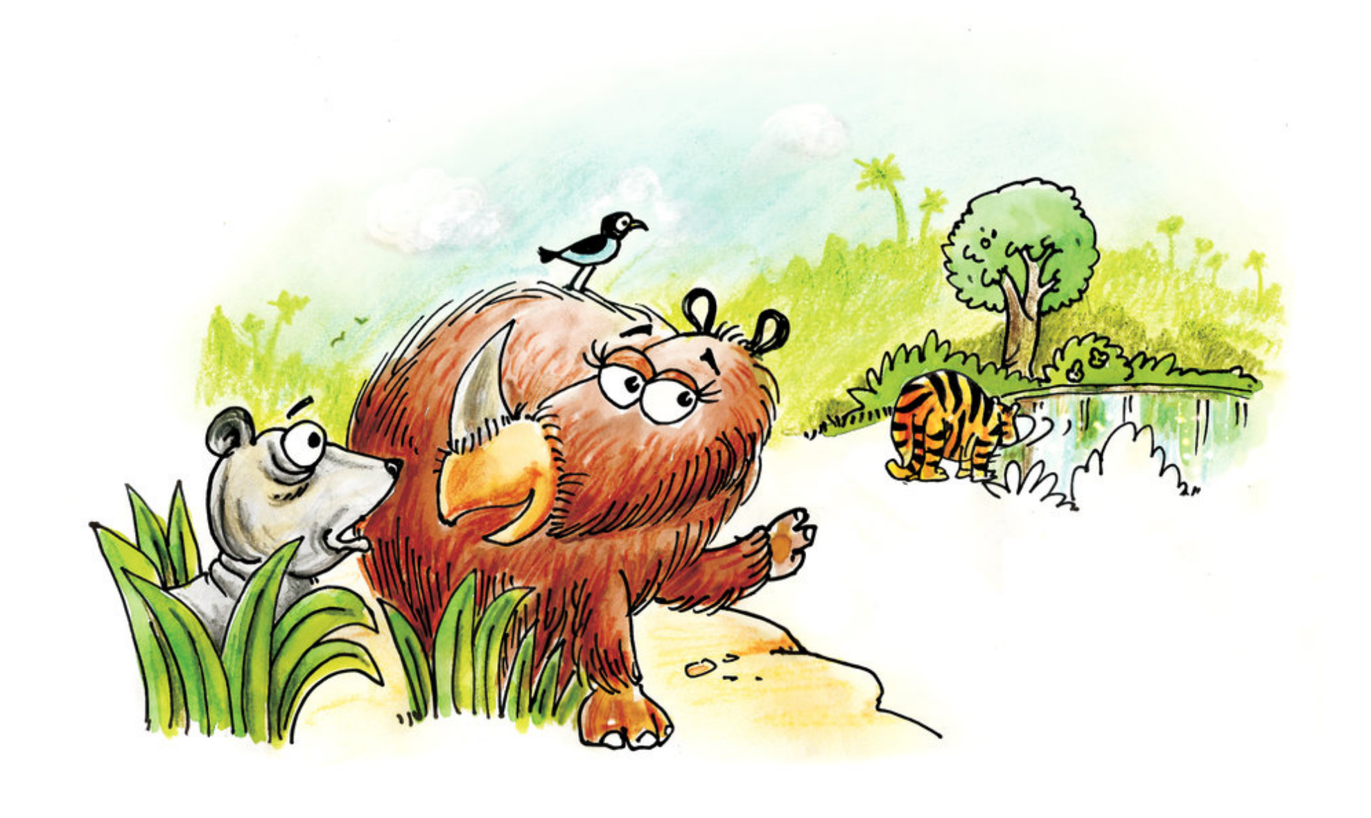
"I want my nice old skin back," sighs Tingu. "Where is Bubbloo Bear?" "There by the pond," Ranga Rhear points. "But Bubbloo is now a biger!"