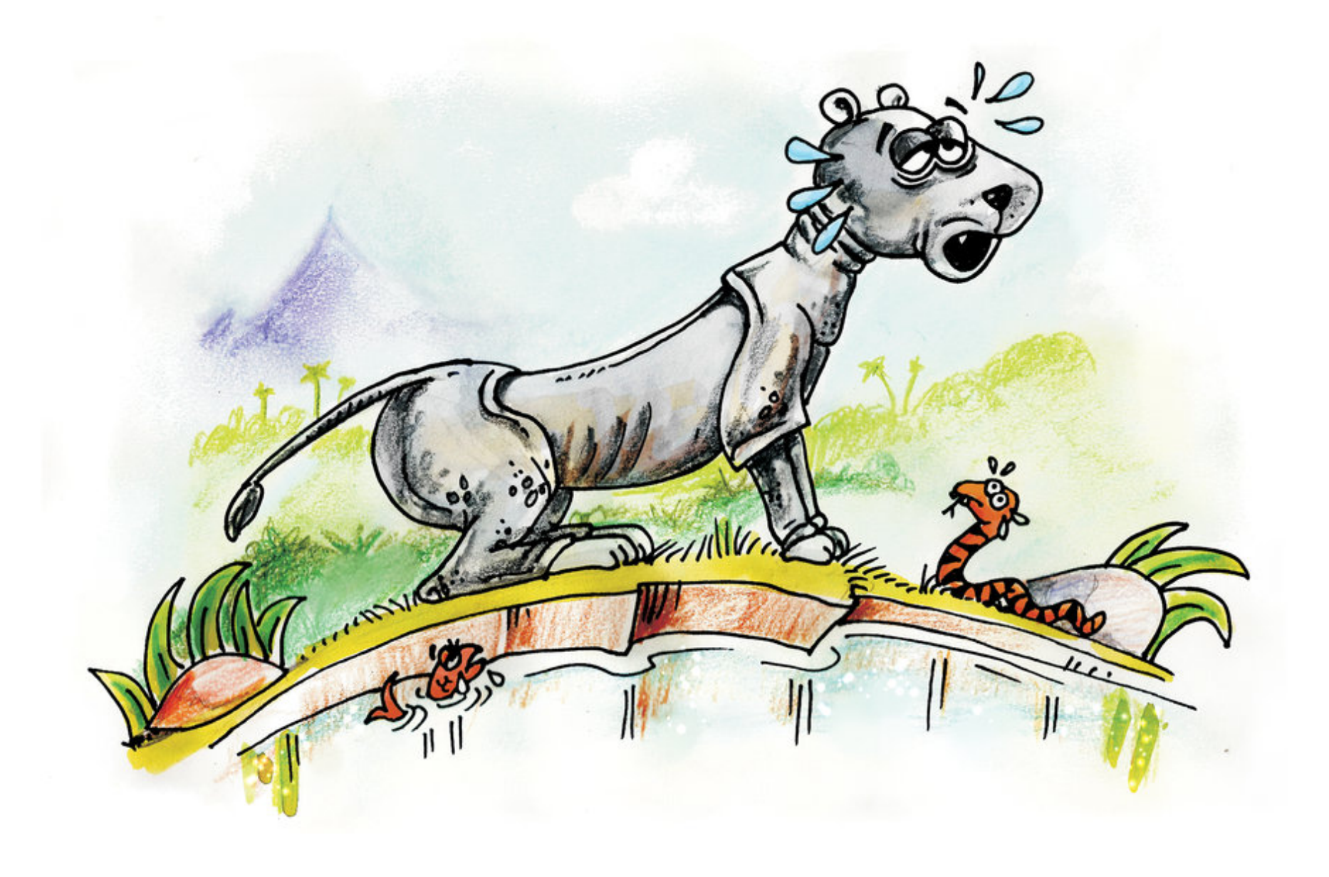
"But I don't want to remain a tino!" cries poor Tingu.