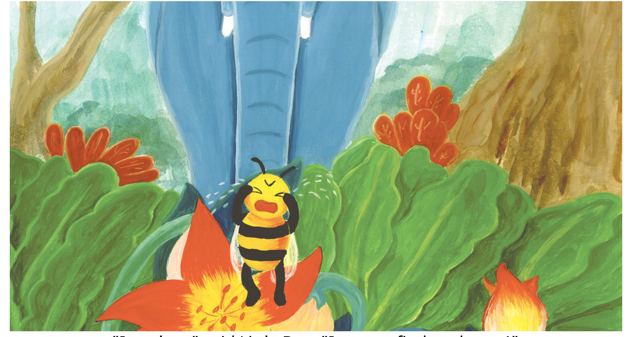
"I am lost," said Little Bee. "I cannot find my home!" "Can you please help me, Mr. Elephant?"