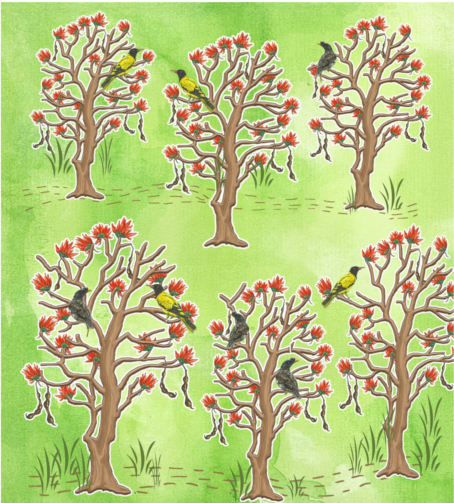
SIX Coral trees beside a farmland, Crimson blossoms to attract many birds.