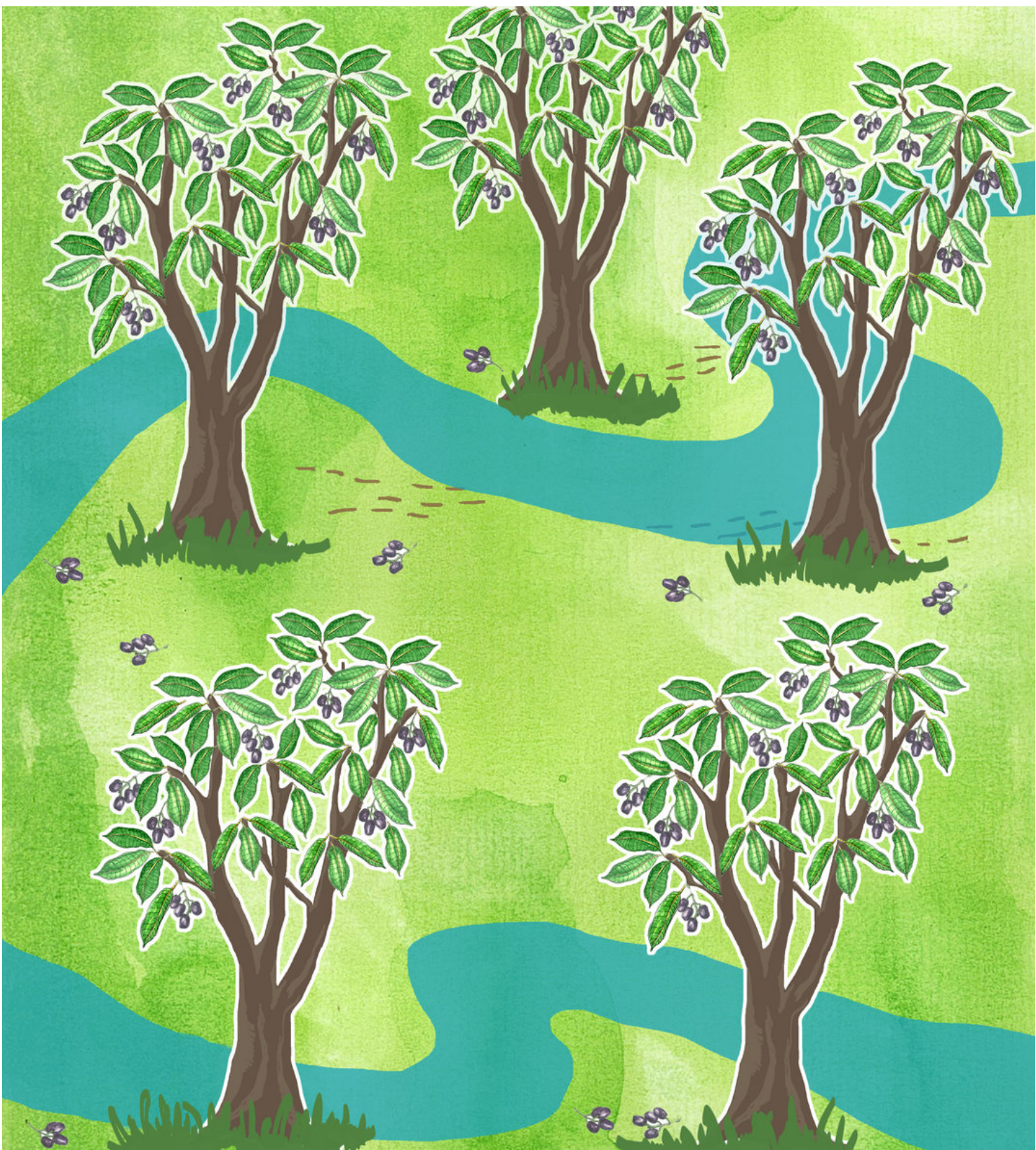
FIVE Jamun trees near a winding stream, Purple fruits littering the forest floor.