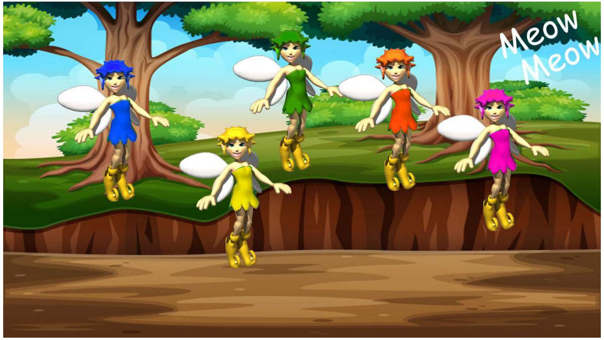
It happened that day that the Sugar Plum Fairies had come to the forest to visit their sister, the Purple Fairy. They heard the kitten crying and flew to the well.