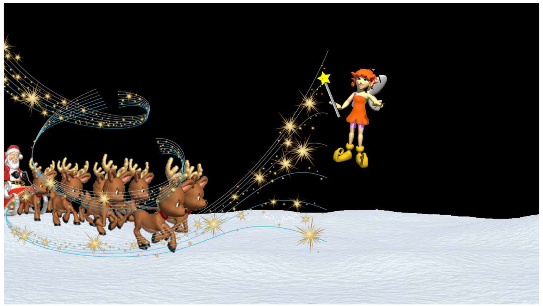
After a long day of loading the bags and sleigh, it is night and time for Santa to deliver the gifts. The reindeer are hooked up to the sleigh and ready for the task ahead. The Orange Fairy is there to cast the spell to help the reindeer fly farther and faster than ever.