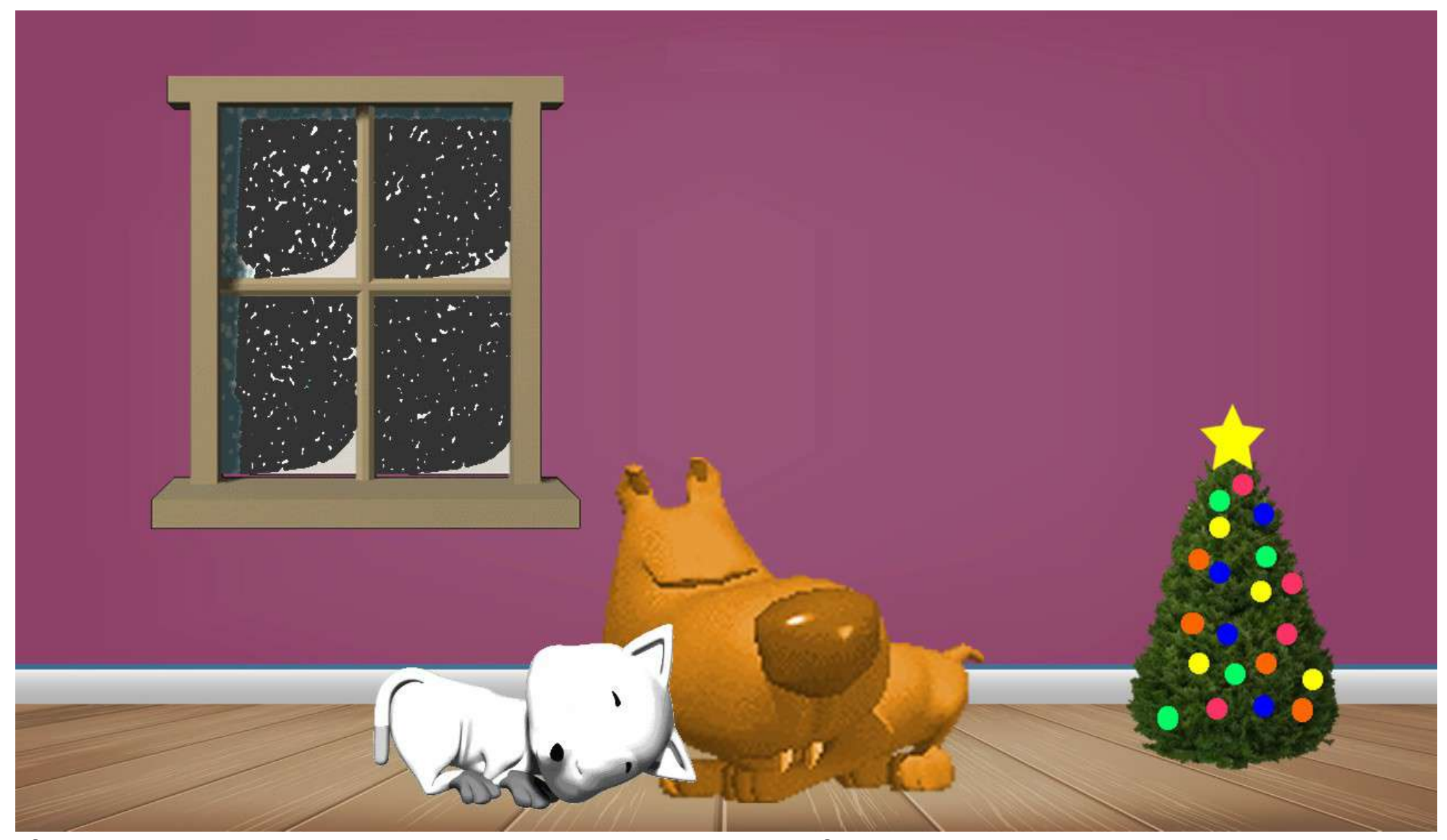
After a long day helping Santa and Mrs. Claus, Iris is ready for a good night's sleep. Click on the sleeping Iris to help her find the brownie ingredients, load Santa's sleigh, and protect the gifts from the Christmas Goblins