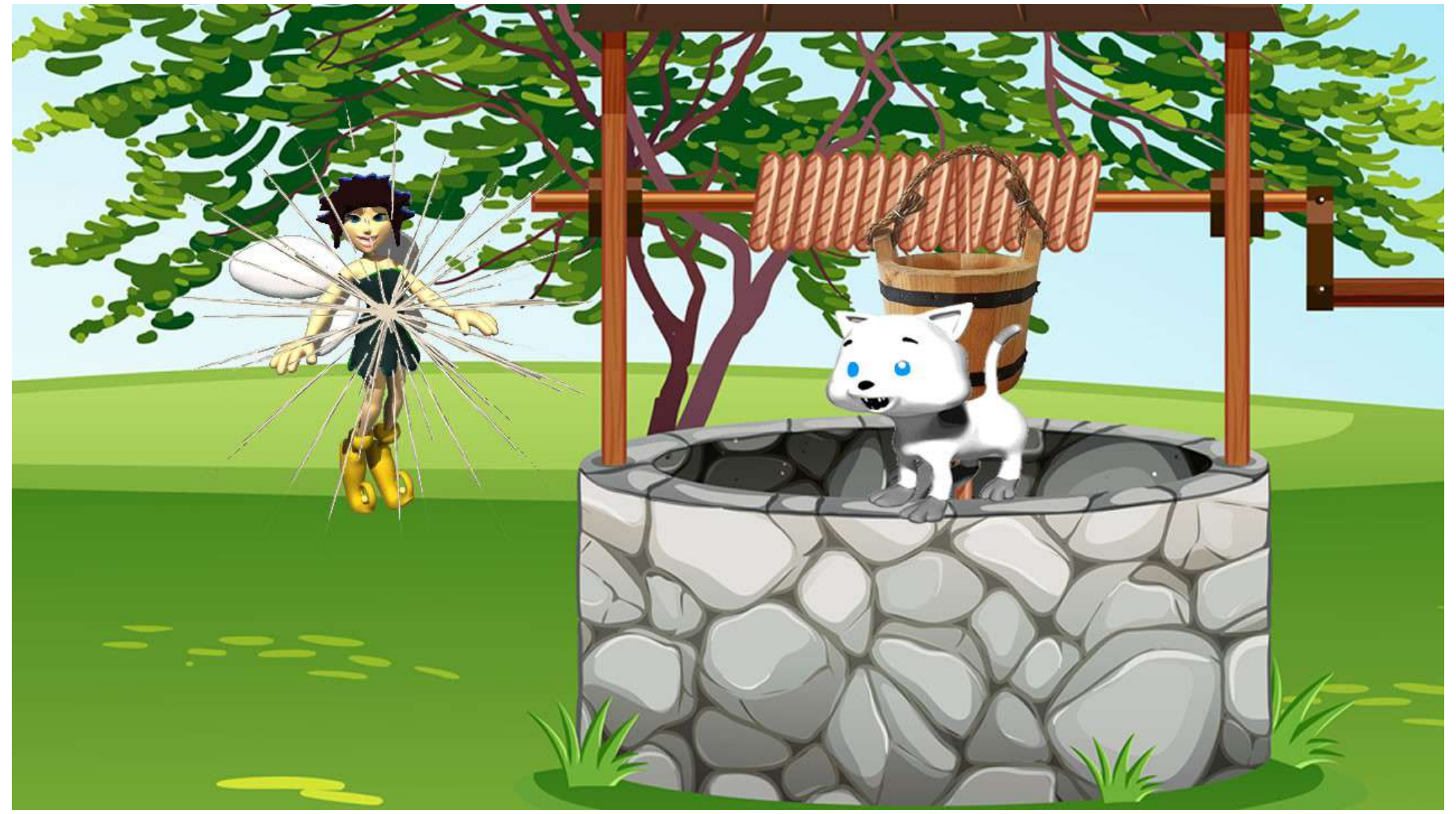
The butterfly led the kitten to a deep, dark well. When the kitten jumped up on the well to catch the butterfly, it turned back into the Dark Fairy and startled her. She fell into the well.