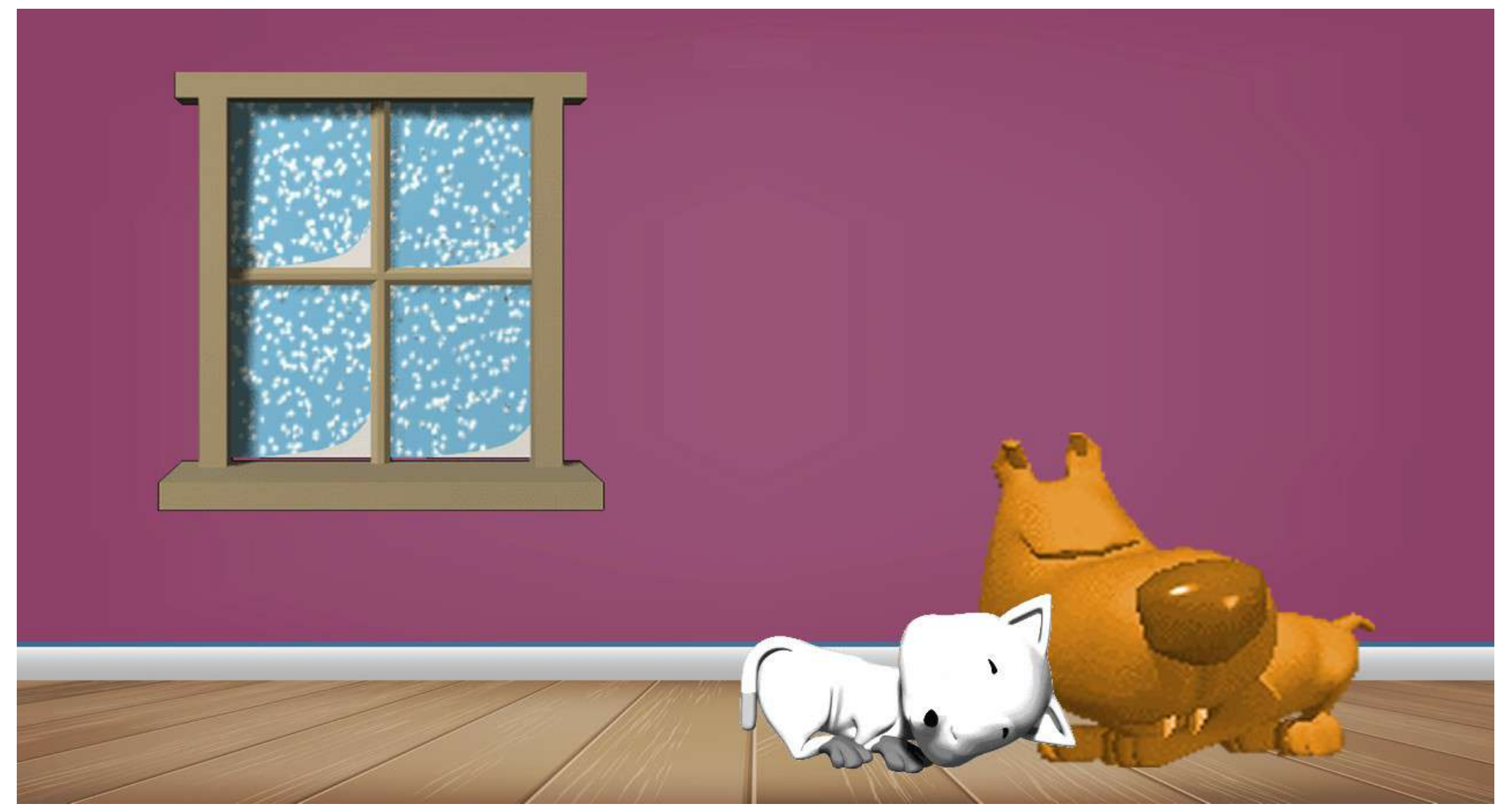
In a while, Iris and Fudge became best of friends. They often slept close together, not just to keep warm but because they were friends.