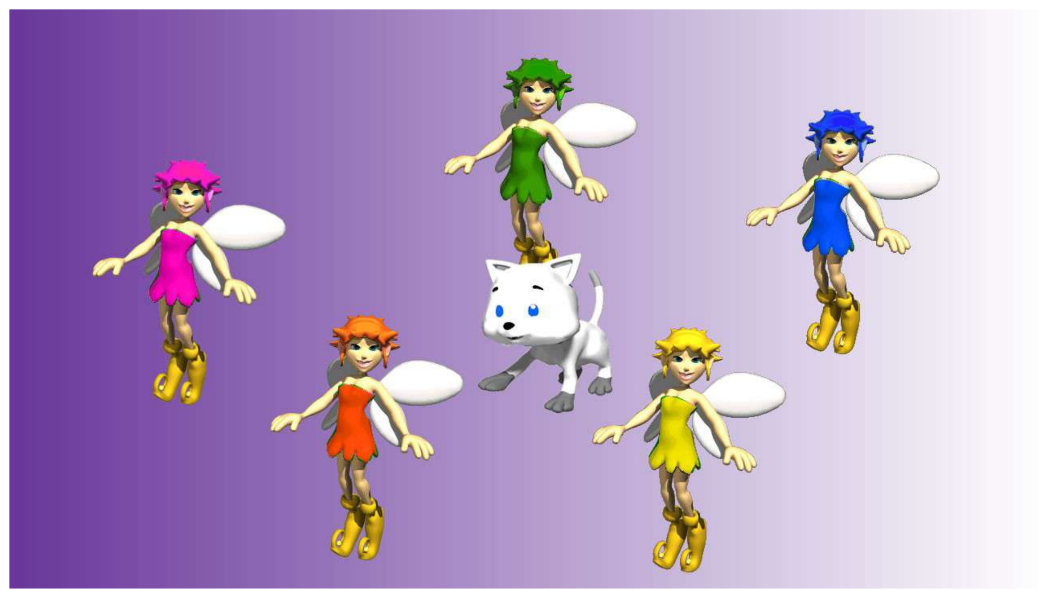
Off they flew to the North Pole. The kitten magically flew too. Can you guess how that happened? The fairies would have to visit their sister another day.