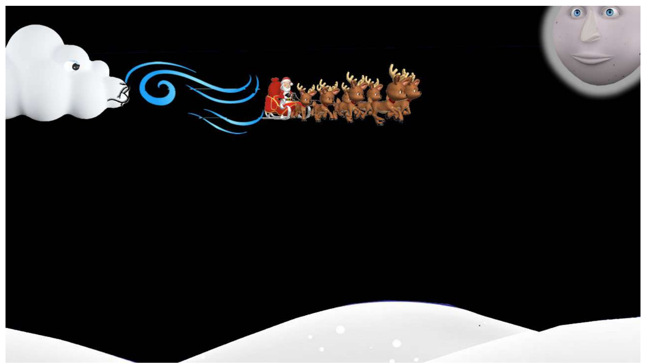
To hasten Santa on his trip, the North Wind blows a big gust of wind. The Man in the Moon looks on, smiling and shining brightly, lighting Santa's way.