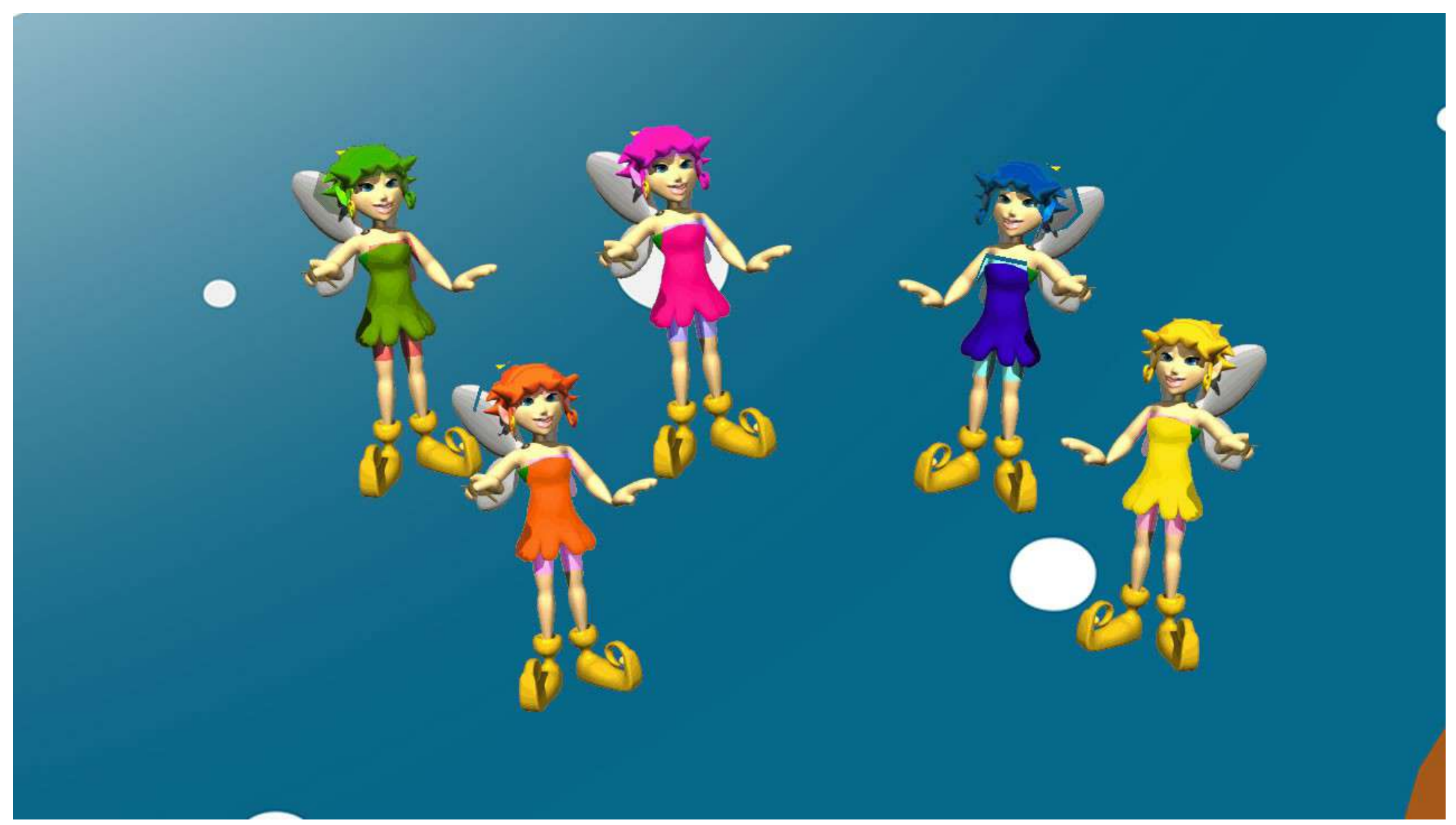
The fairies had a quick discussion amongst themselves . What do you think they are talking about?