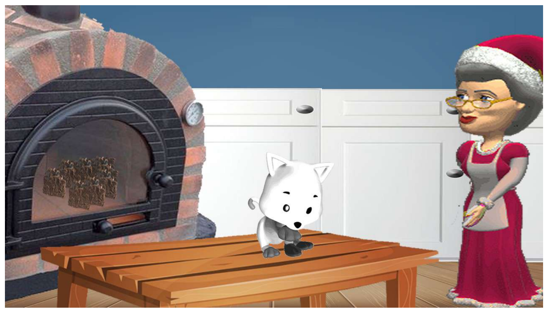
Mrs. Claus and Iris thought about the riddle, "If they are 'about', they are 'near'. If they are 'not out' they are 'in'. " said Mrs. Claus. Where do you think the ingredients are? In the kitchen what is 'near' and could have something put 'in'.