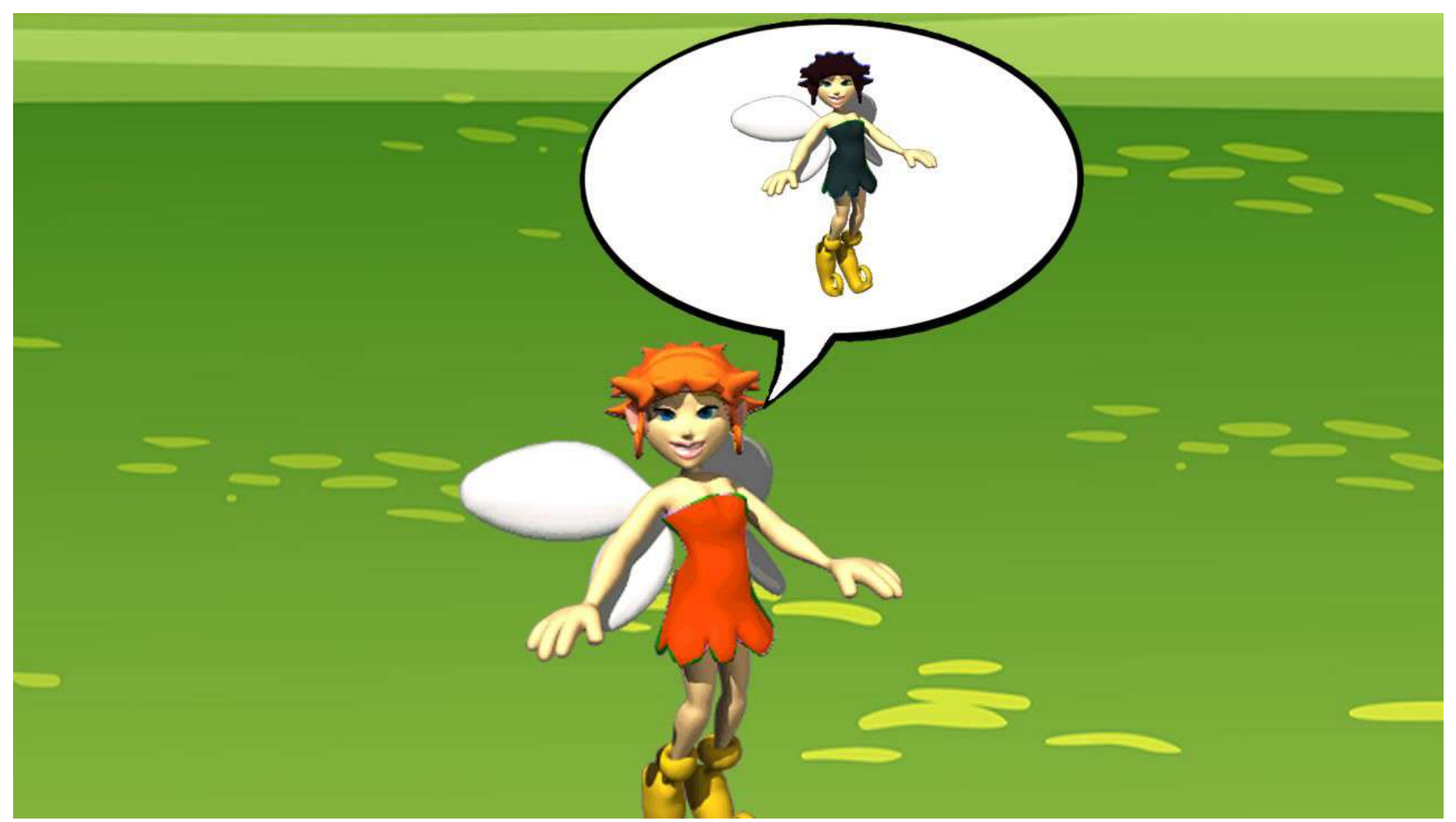
The Orange Fairy said, "I bet it was the Dark Fairy. She is wicked and likes to disguise herself in blue. I wish she were not our sister." Yes, besides the Purple Fairy, the Dark Fairy is also their sister.