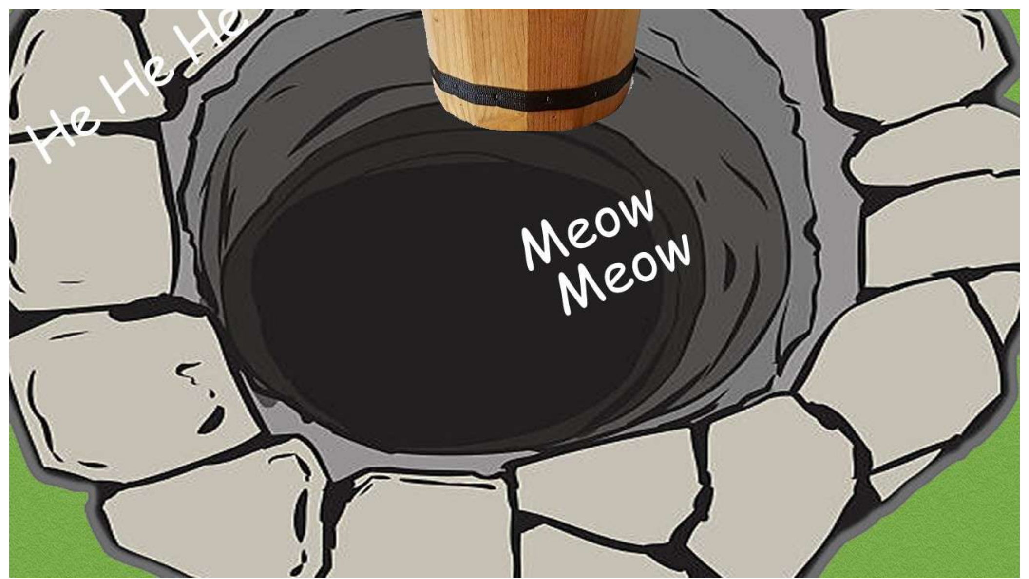
The fairy laughed and flew away. The kitten was at the bottom of the well, wet and scared. She was crying, "Meow, Meow." She had bumped her head on the way down.