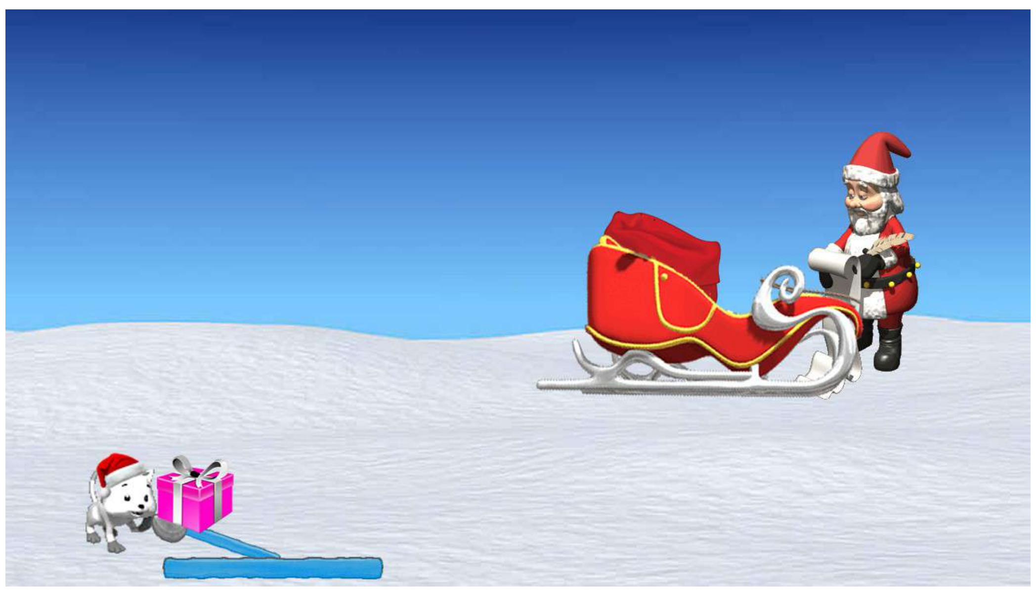
Iris is also a big help to Santa, especially on Christmas Eve. She helps him load his sleigh. She shoots the gifts into his bag while he checks them off. Sometimes she misses and Santa has to duck.