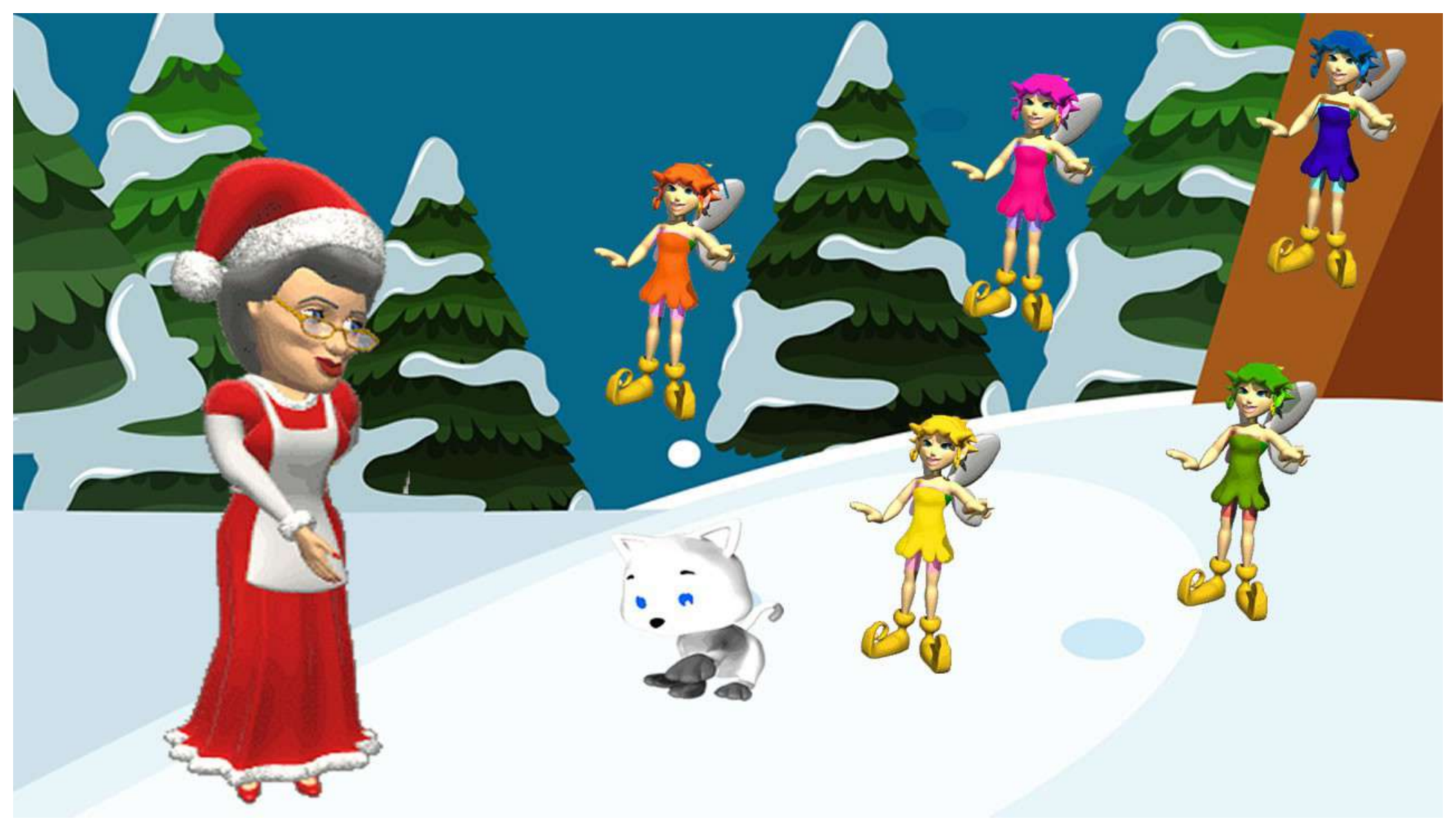
When they arrived, Mrs. Claus saw the kitten and said, "Oh, Santa loves kittens. He had a white kitten with green eyes when he was a little boy."