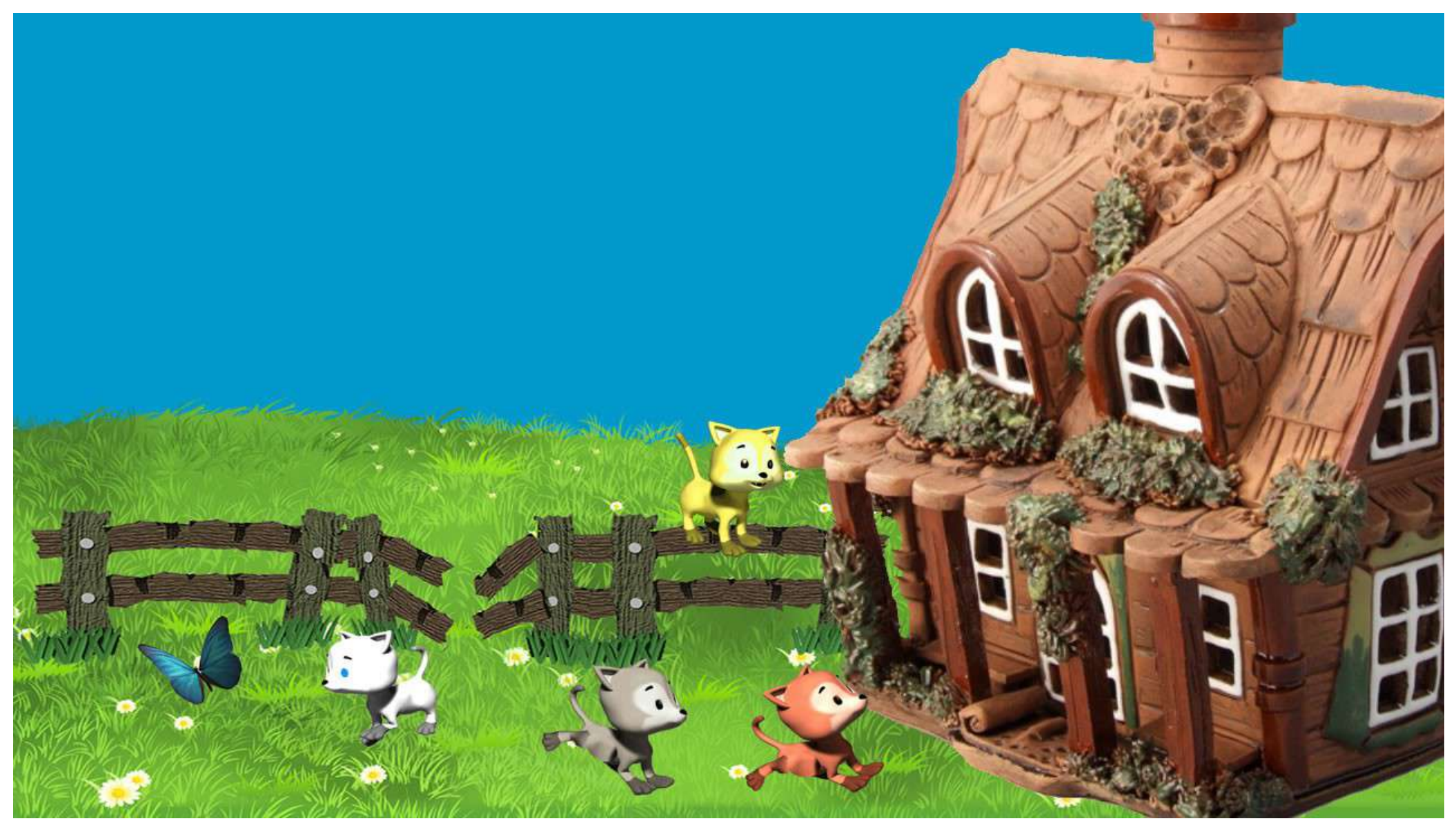
Four little kittens were outside their home looking for their mittens. The Dark Fairy came and turned into a blue butterfly. One of the kittens, a white one, began to chase the butterfly, as kittens will do.