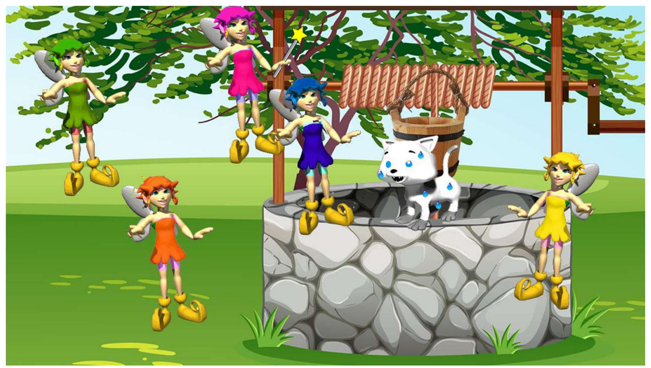
The Pink Fairy waved her wand and the kitten rose out of the well. She was now cold, wet and scared. The Blue Fairy asked, "Who put you in the well?" "I don't know. I remember chasing a blue butterfly then I found myself in the well." replied the kitten.