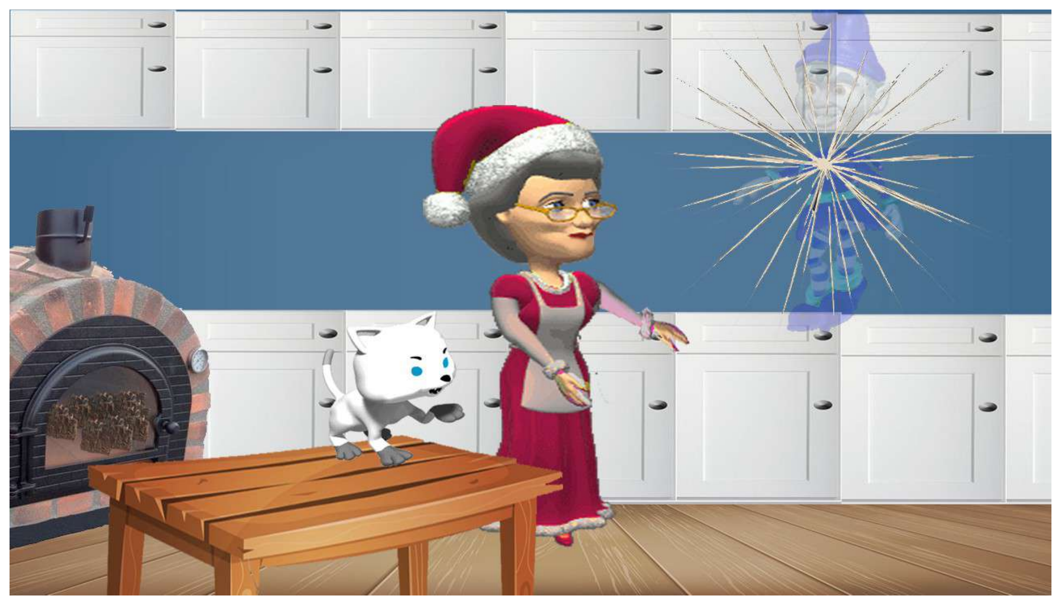
When Mrs. Claus came back, Iris had just woken up. Jack was still there but the ingredients were not. He had hidden them. She said, "Jack, where are my ...?" But before she could finish the question Jack had disappeared laughing and said, "They are about but they are not out." What a riddle!