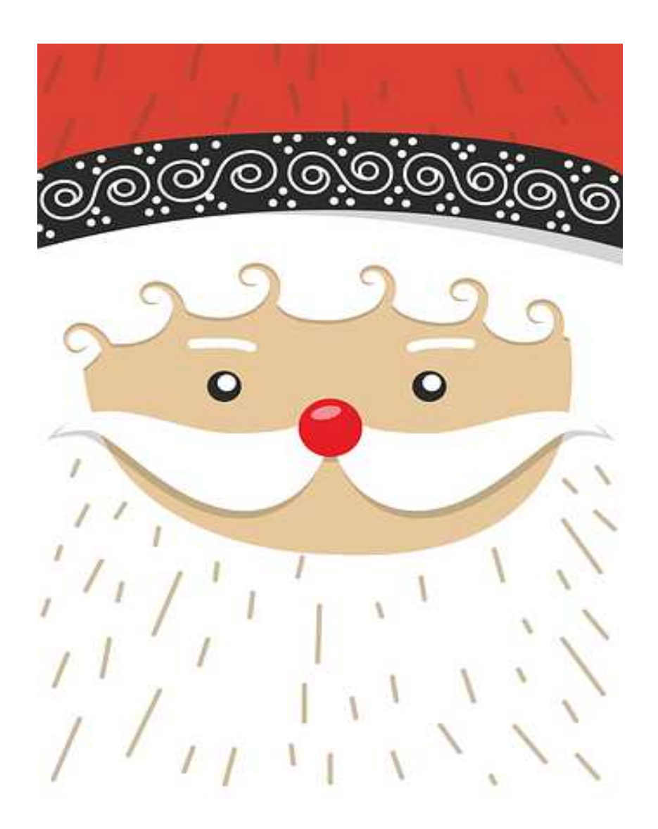
"Well, fill it somewhere else. You don't get to take kiddies on my day or the Easter Bunny's—we all agreed."

The first voice whined, "But look what he's doing. He must be so high on your naughty list that he needs to be taught a lesson."