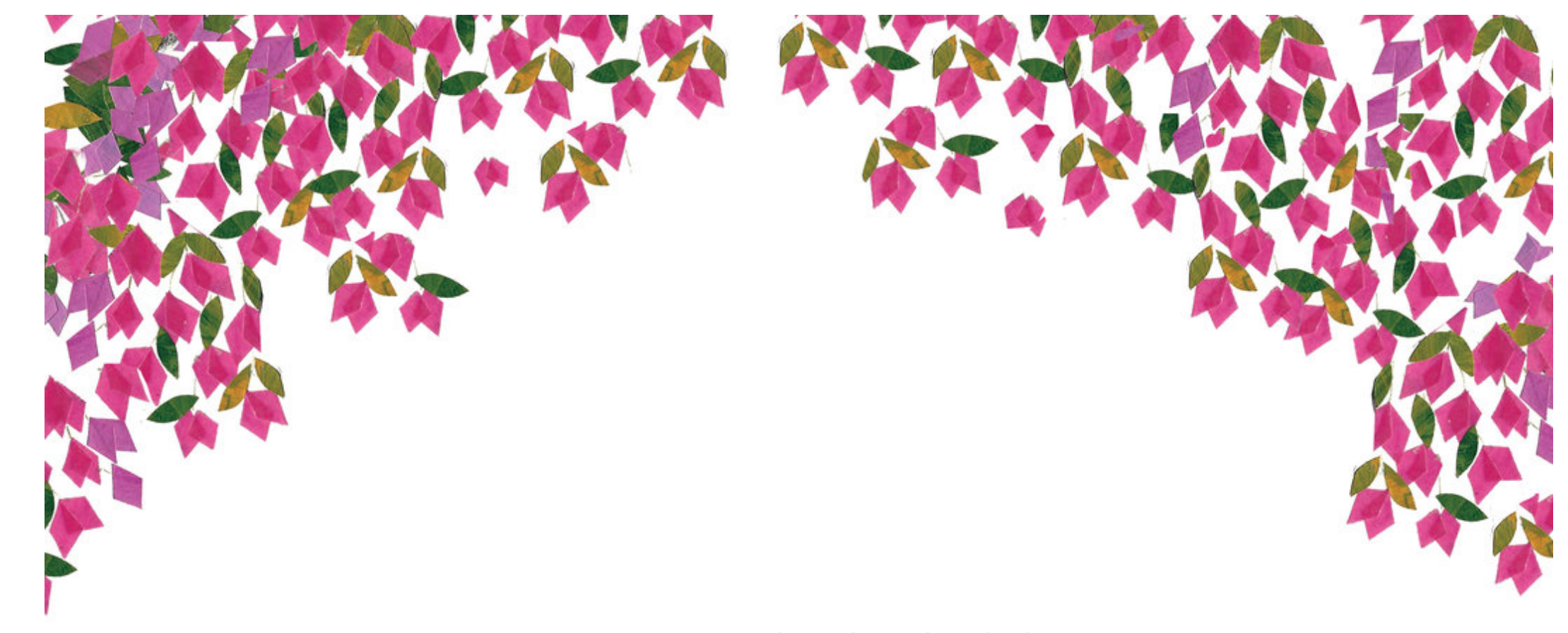
He ties Lalita up under the shady bougainvillea.