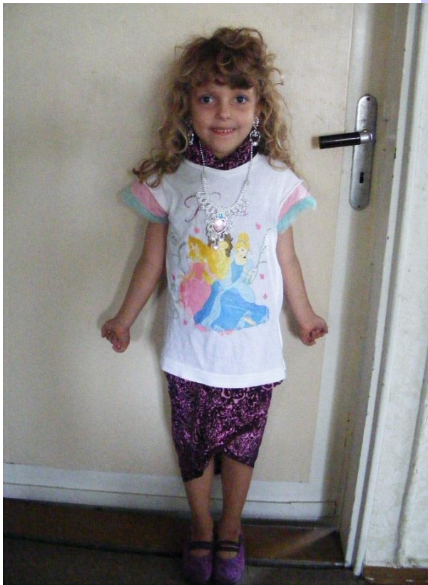
Then it was time to go and see the butterflies