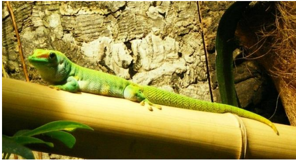
Mum's Gecko book